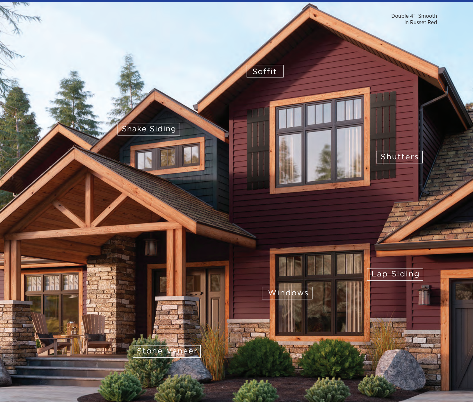
Double 4" Smooth in Russet Red