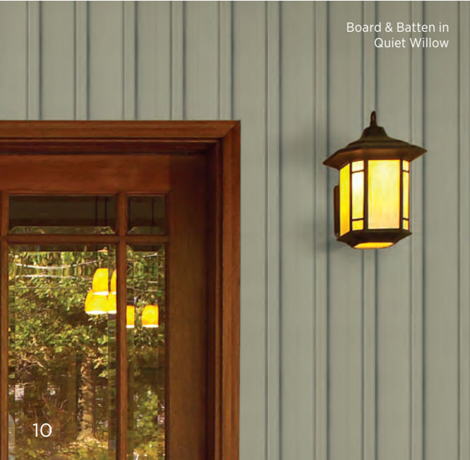
Board & Batten in Quiet Willow