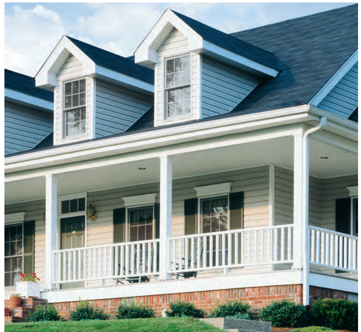
Double 5" Dutch Lap Woodgrain in Everest

Not all colors are available in all profiles.