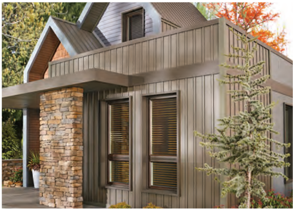
Board & Batten in Rugged Canyon