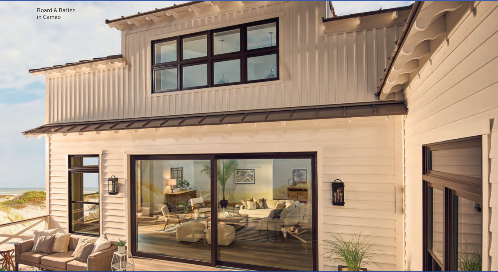
Board & Batten in Cameo

Vinyl siding is the number one cladding choice in America. In fact, more than twice as many homeowners side with vinyl over stucco, fiber cement, or wood † .