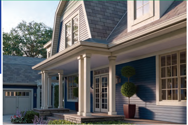
Double 5" Woodgrain in English Wedgewood