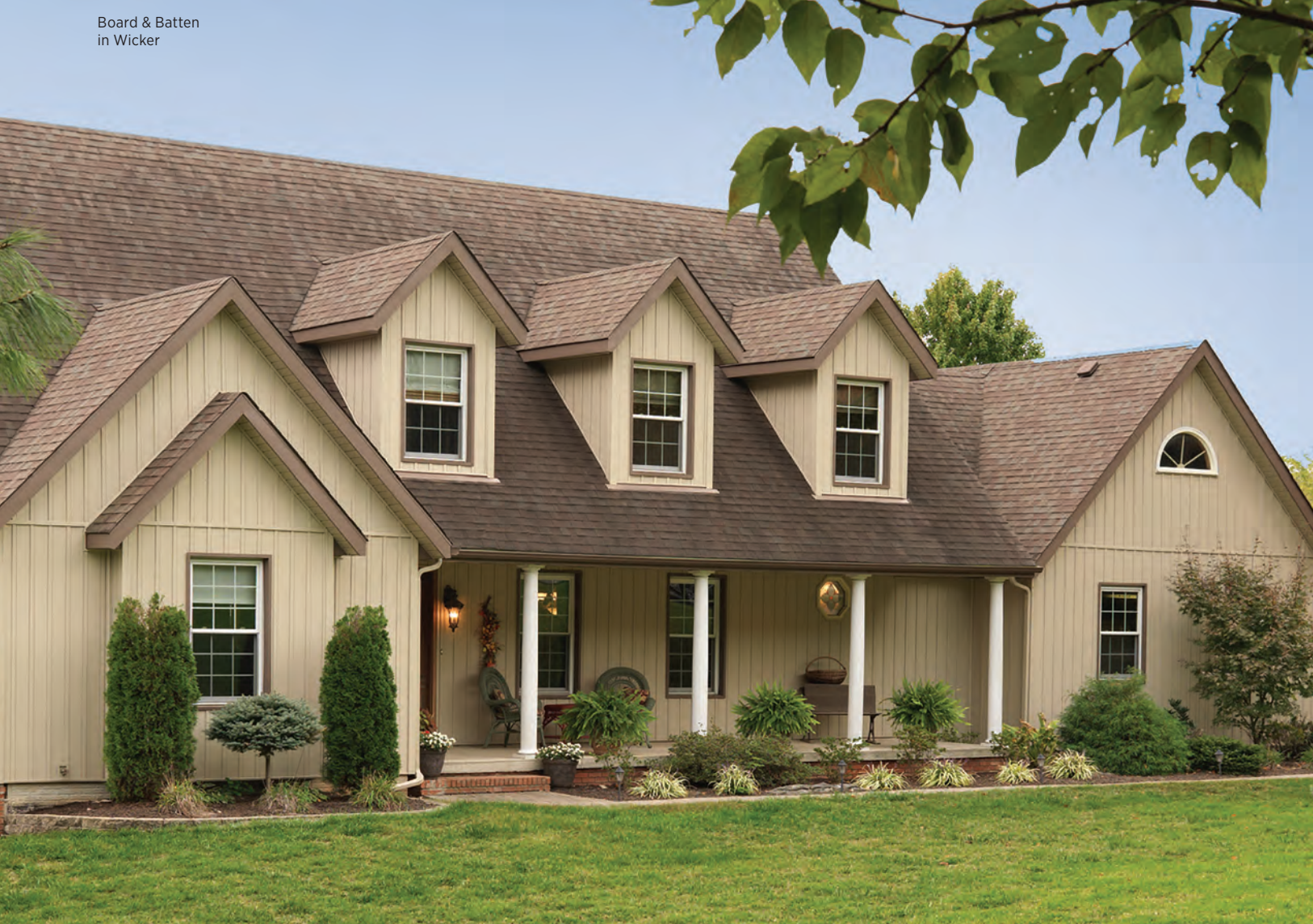
Board & Batten in Wicker