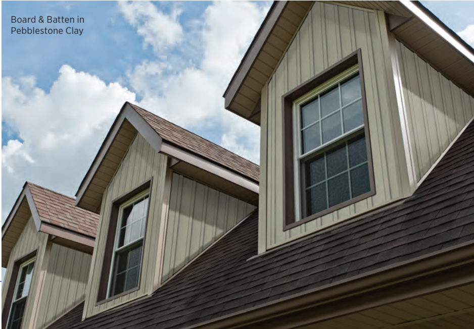
Board & Batten in Pebblestone Clay