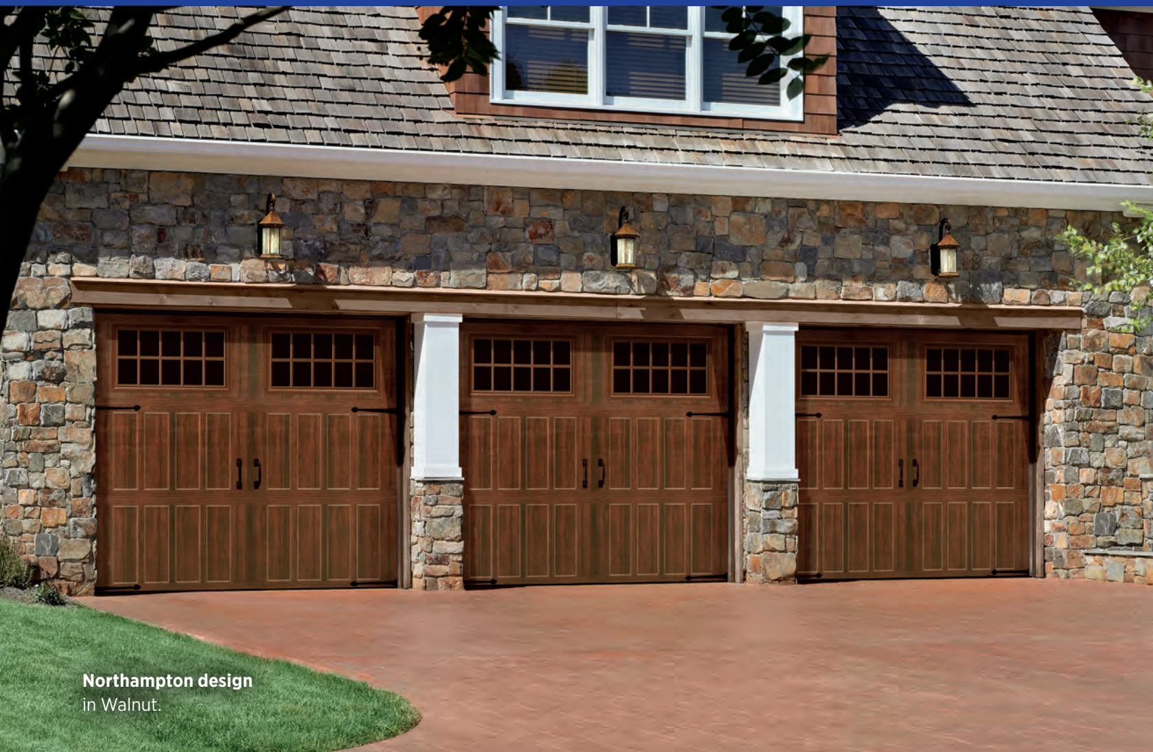
Northampton design in Walnut.