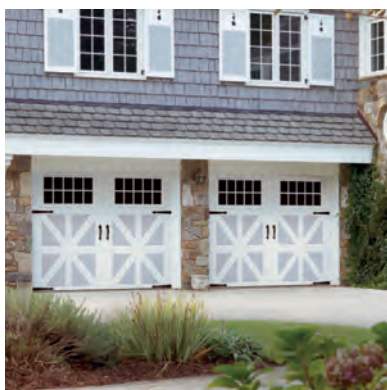
Santiago design in True White/Gray with Madeira windows and Blue Ridge handles and hinges.