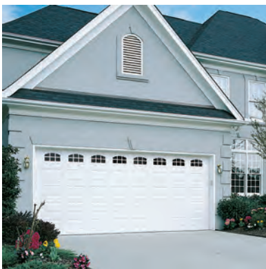
Short Panel design in True White with Cascade decorative window inserts.