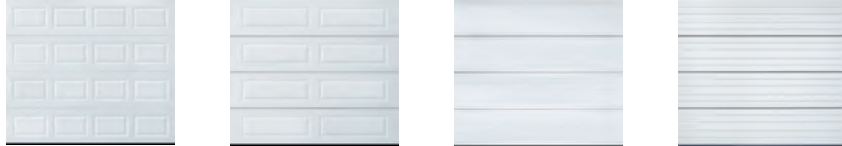
SP • SHORT PANEL LP • LONG PANEL FP • FLUSH PANEL RP • RIBBED PANEL*

*Available in Amarr Lincoln LI3138 only.