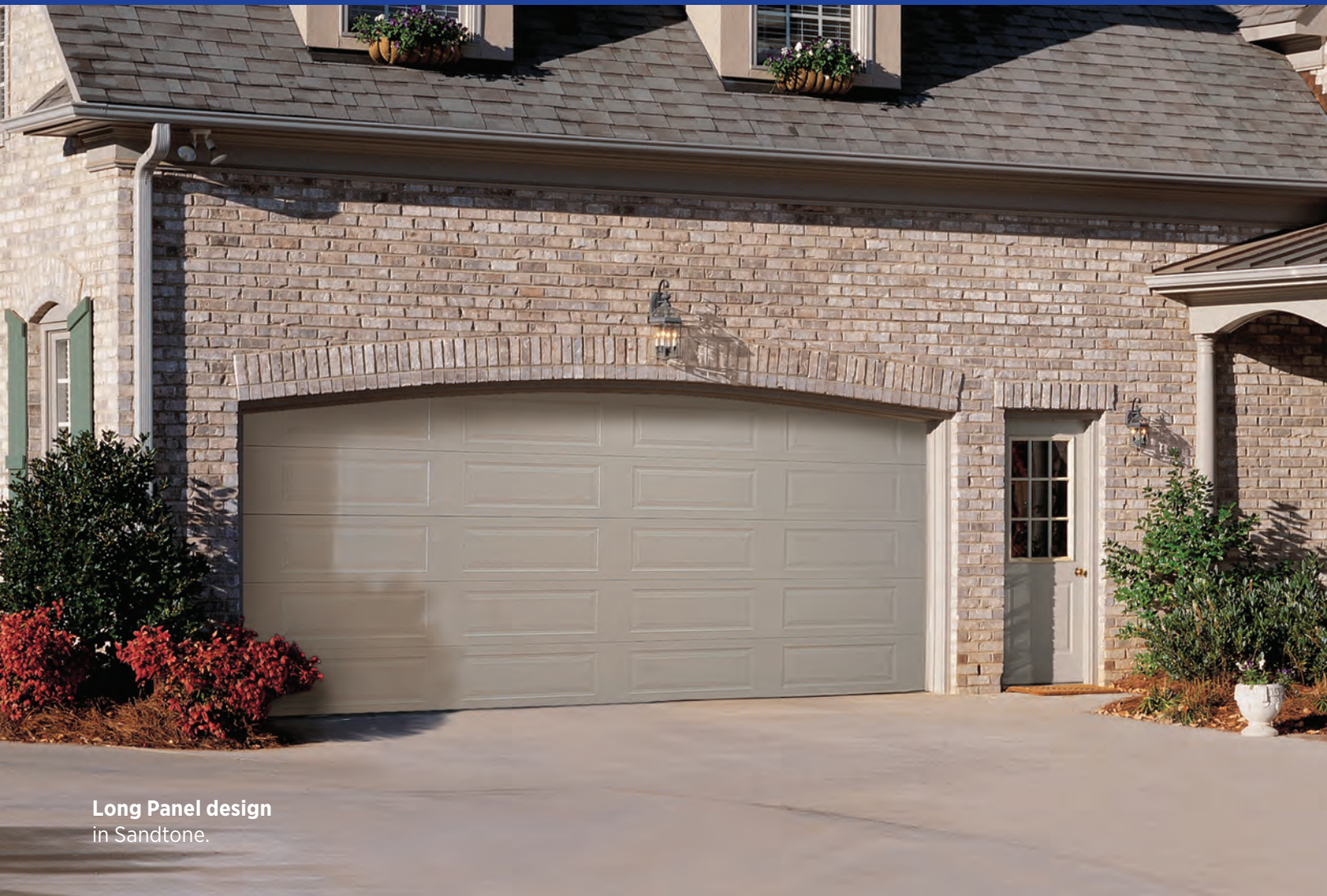
Long Panel design in Sandtone.