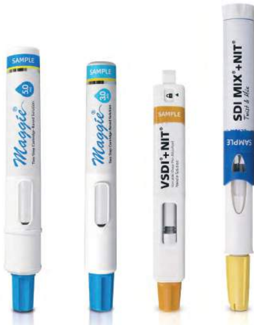
Figure 3: Designed to address the needs of varying molecules, SHL's NIT® family of devices includes autoinjectors for larger-volume, lyophilised and other speciality formulations.

the technology gap between PFS-based autoinjectors and on-body patch pumps. In response to this need, SHL recently launched Maggie 5 mL – the larger-volume variety within the Maggie family of devices. This larger-volume version leverages the lessons gathered from its predecessor and retains the two-step injection handling sequence (Figure 2).