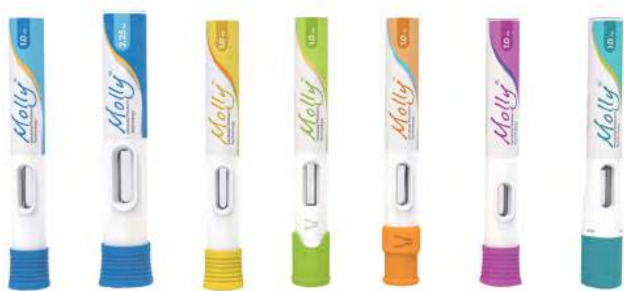
Figure 4: Enabled by platform modularity, the Molly autoinjector technology is always evolving and allows for various customisations according to industrial design, branding and commercialisation strategy, formulation and patient requirements.

“True to its modular product design, expanding the Molly’s design attributes to improve device performance is an active pursuit – SHL has seen technical progress in the delivery of higher-viscosity drugs, while also maintaining the same device geometry.”