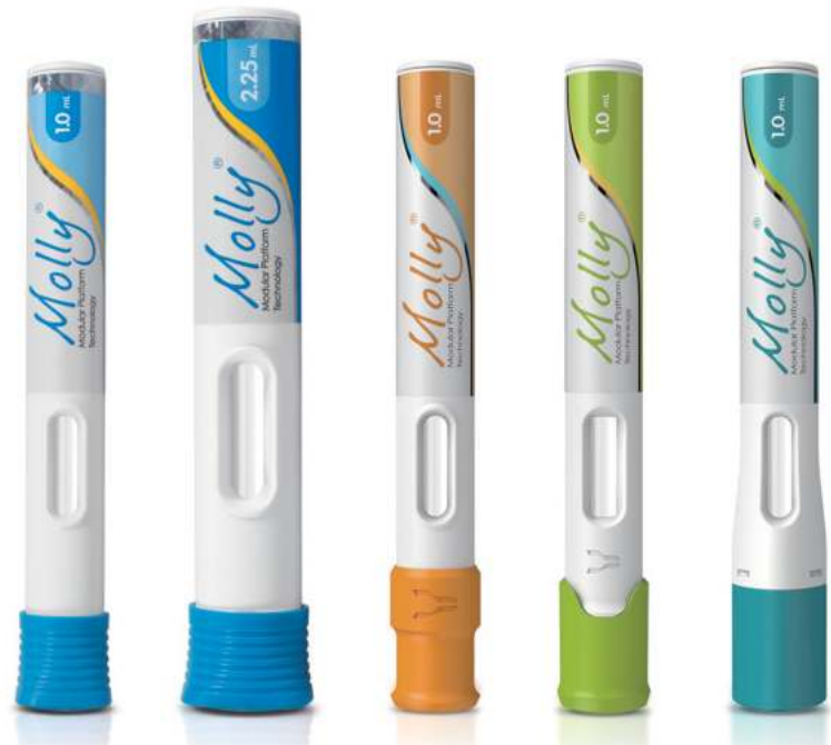
Figure 2: Built upon proven experience in the cardiometabolic space, SHL’s modular Molly platform autoinjectors are well positioned to address the up-and-coming developments in this therapy area.

globally dispersed infrastructure capable of scaling manufacturing. They also need to ensure high satisfaction rates for end users. SHL’s Molly autoinjector has consistently