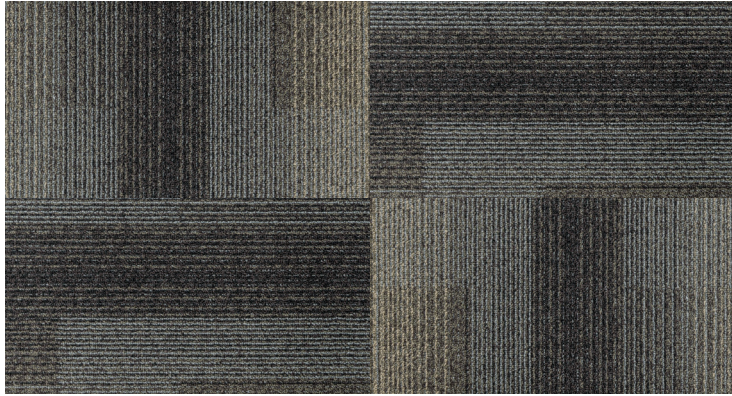
NE811011 | Iron Ore