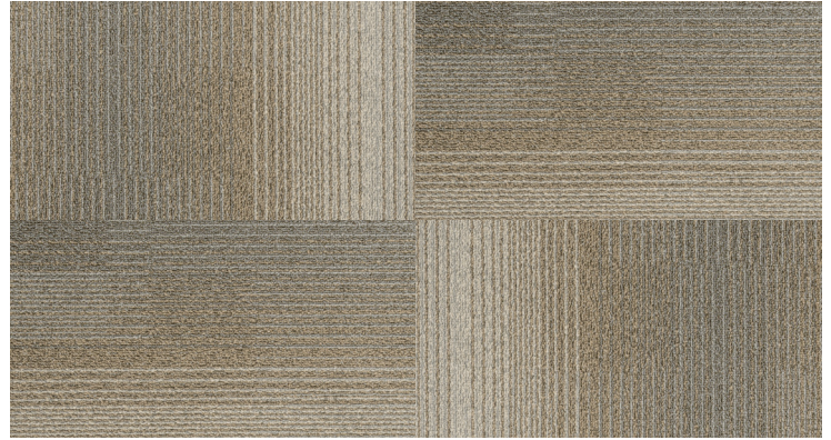
NE811013 | Camel