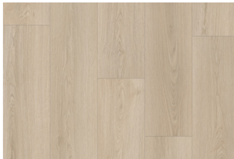
Winterthur | DGRC0803