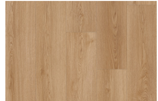
Meadow Brook | DGRC0805