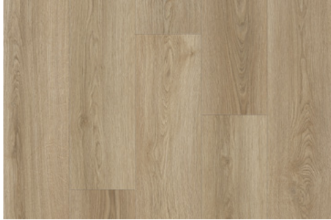
Biltmore | DGRC0801