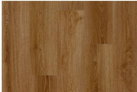
Lynnewood | DGRC0804