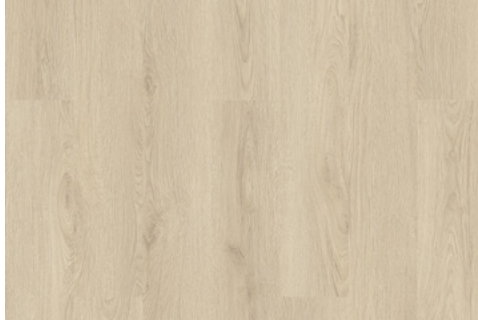
Fairlawn | DGRC0808