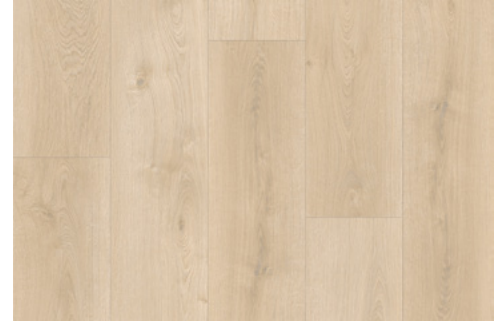
Florham | DGRC0806