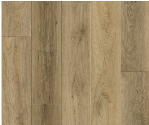
Carlsberg | WIRC0404