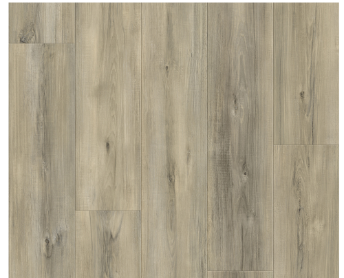
Lansing | WIRC0406