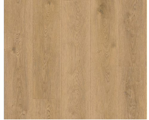
Middlebury | WIRC0403