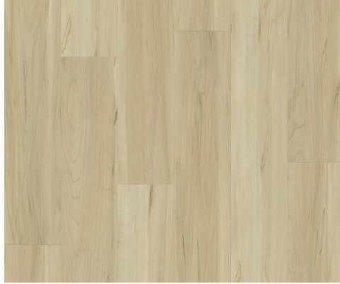
Greensboro | WIRC0402