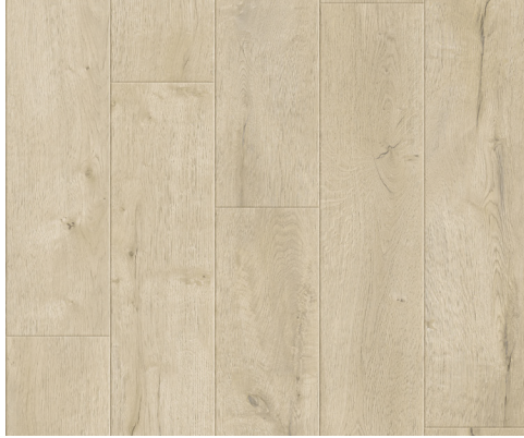
Nicholas | WIRC0401