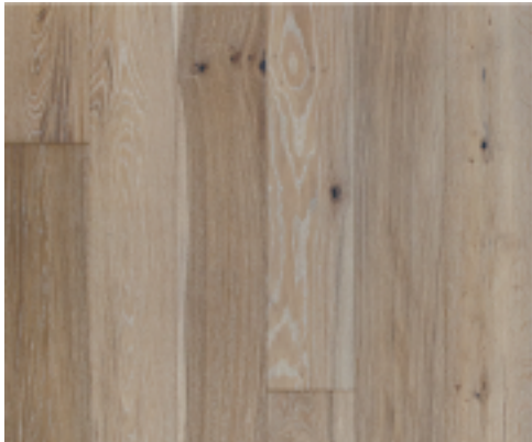
Burkshires | HFDMO7167BK