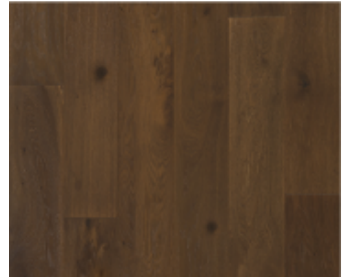
Highland | HFDMO7167HL