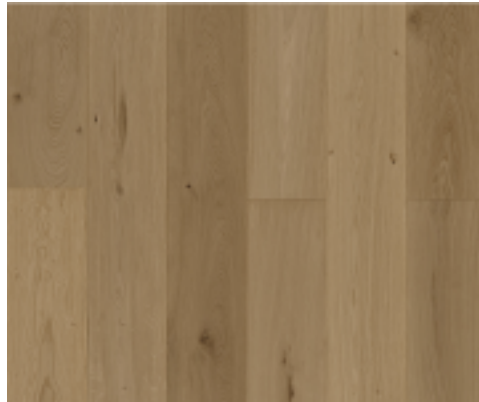
Calabazas | HFDMO7167CS