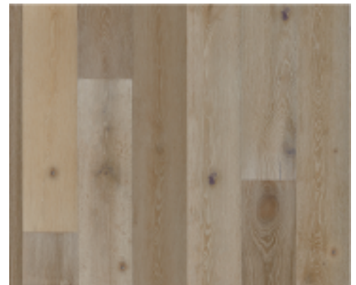
Palm Gray | HFDMO7167PG