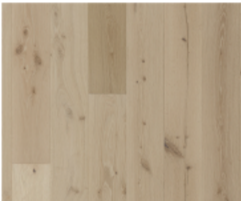
Irwindale | HFDMO7167ID