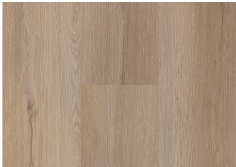
Imperial Khaki | NE450704