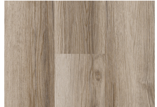
Modern Hickory | NE450500