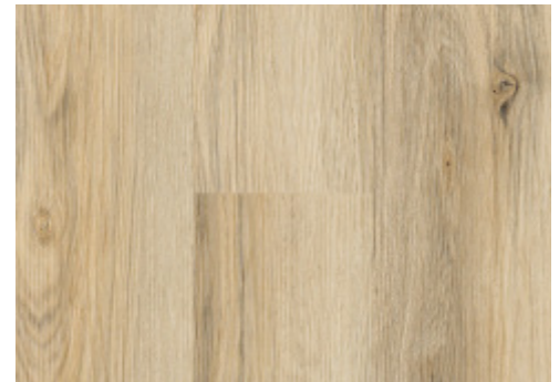
Vanilla Hickory | NE450503