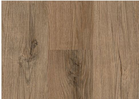
Heritage Hickory | NE450702