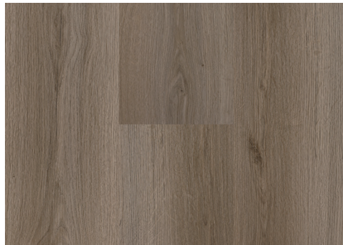
Modern Taupe | NE450706