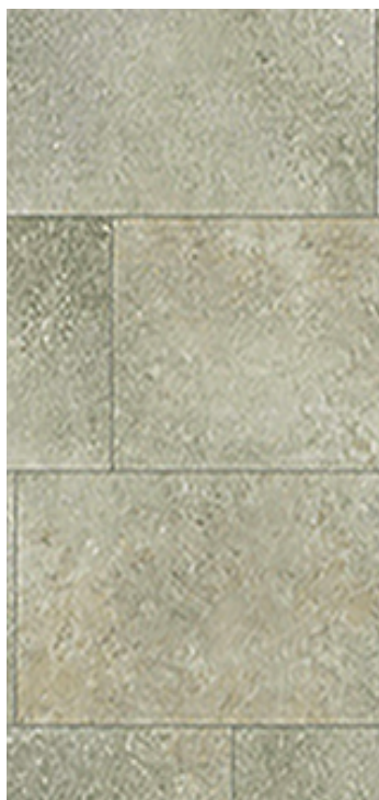
Rattlesnake Ridge | NFRC0304