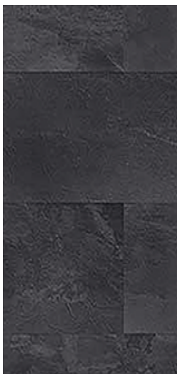
Lookout Point | NFRC0301