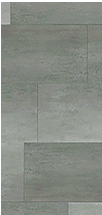
Ocean View | NFRC0303