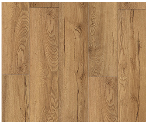
Talus | CHCWA263V