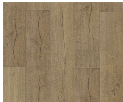
Viewpoint | CHCWA1500V