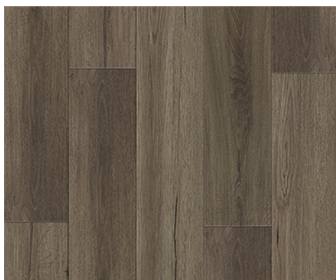
Vista | CHCWA1351V