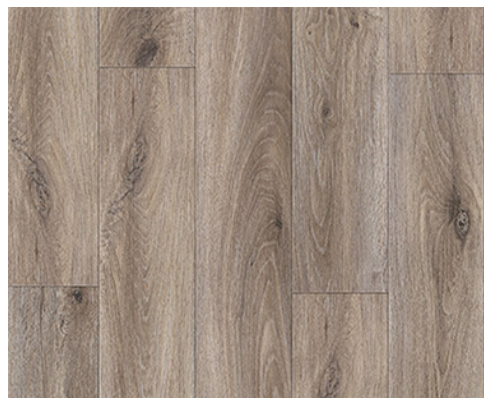
Alpine | CHCWA330V