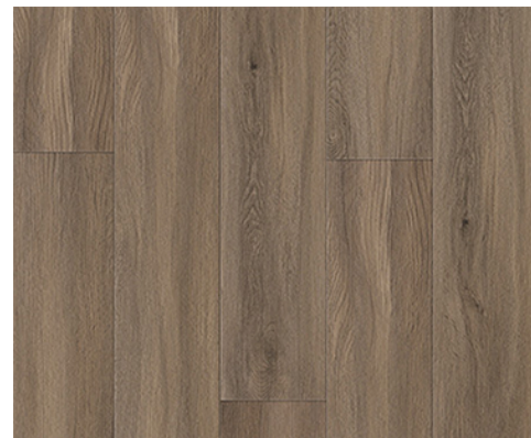
Summit | CHCWA933V