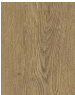
Placid | DGRC0906