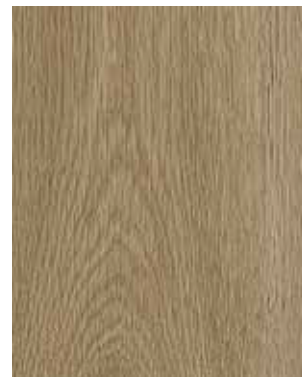
Quell | DGRC0905