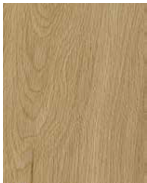
Canard | DGRC0902