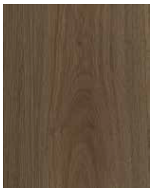
Content | DGRC0907