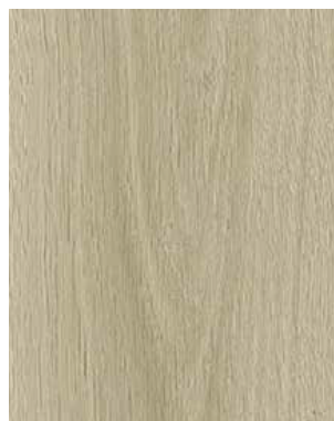
Whisper | DGRC0909