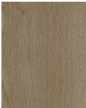
Belie | DGRC0903