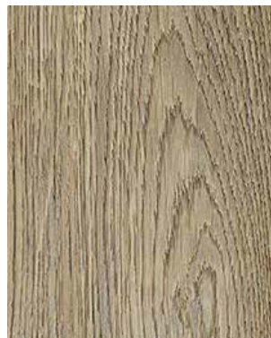
Murmur | DGRC0904