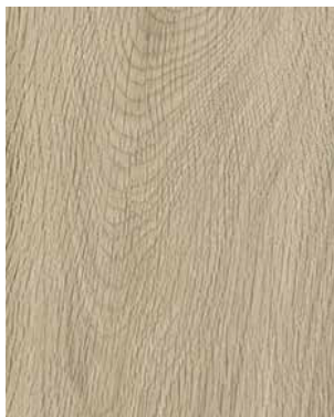
Reserve | DGRC0901