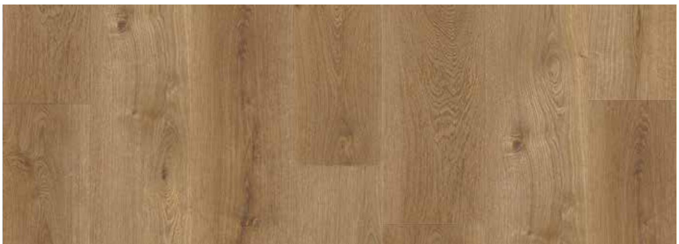
FALSTAFF LUXURY VINYL