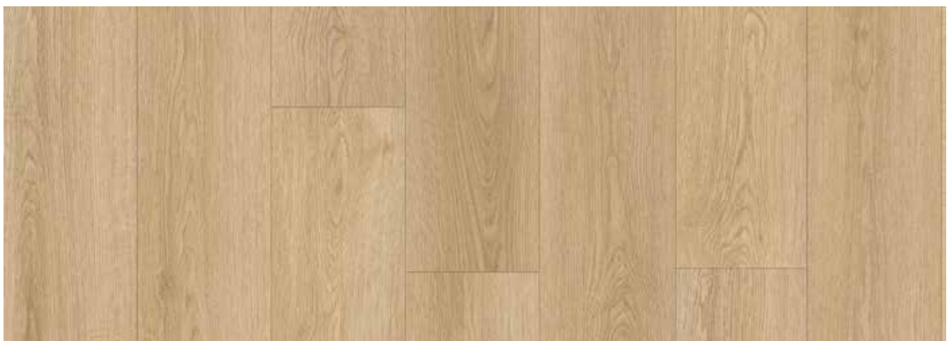
AIDA LUXURY VINYL