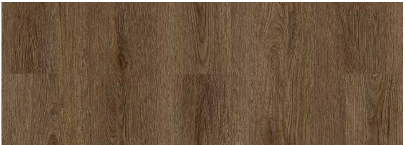
FIGARO LUXURY VINYL