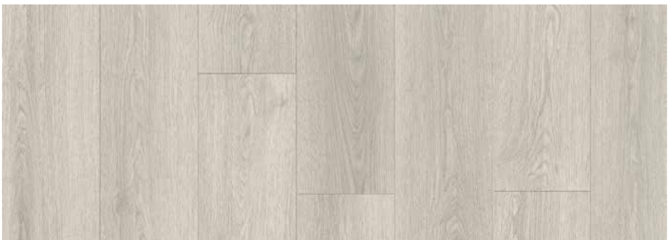
CARMAN LUXURY VINYL