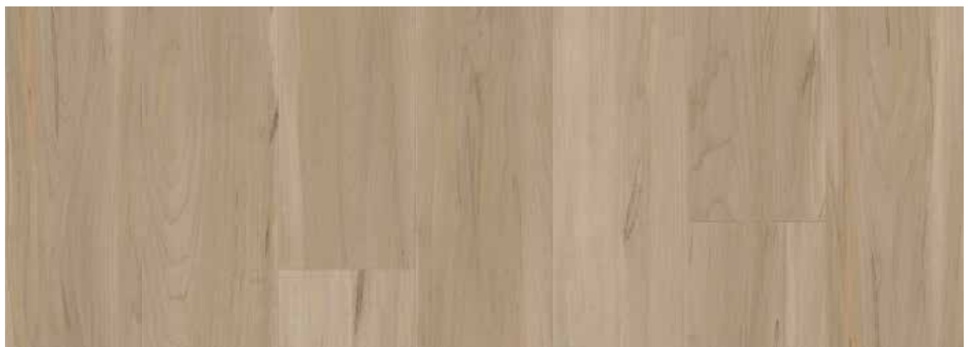
RIGOLETTO LUXURY VINYL