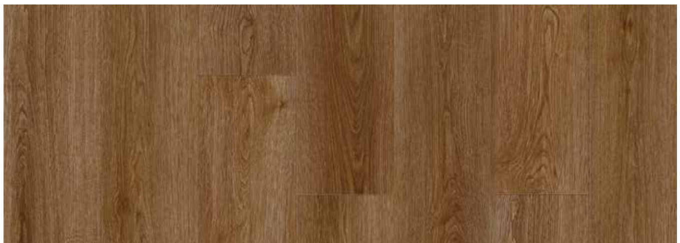
LUCIA LUXURY VINYL