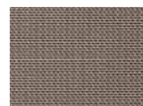
Saddle Stitch 7612