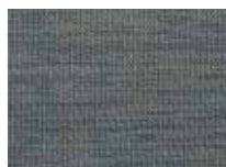
Ocean Ribbon 7627