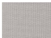
Oyster Braid 7609