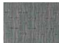
Teal Twine 7613