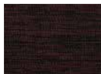
Port Blend 7625