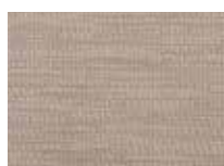
Calico Cloth 7623