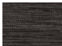
Midnight Haze 7621