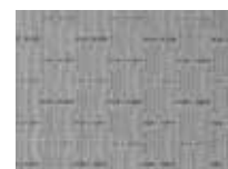
Urban Pearl 7614