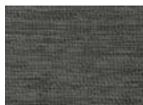
Smoked Thread 7619