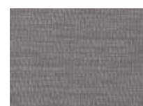
Monument Slate 7618