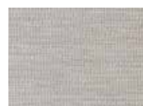
Linen Cloud 7617