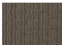
Caramel Gild 7616