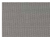
Metropolis Loop 7610