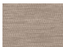
Ecru Mix 7624