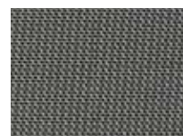
Eclipse Yarn 7611