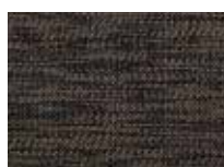
Henna Roast 7622