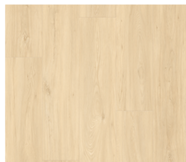
Jackson | SCLA0208