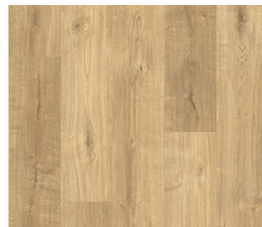
Lincoln | SCLA0204