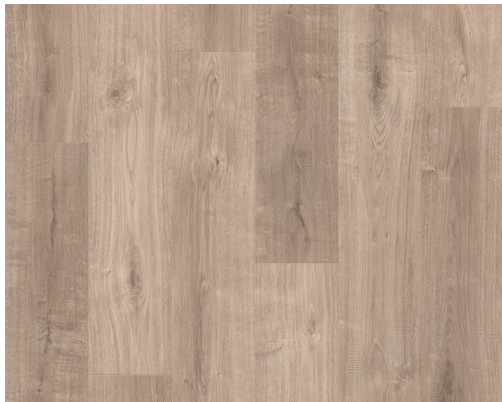
Lincoln | SCLA0204