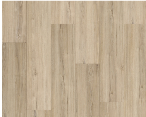
Augusta | SCLA0202