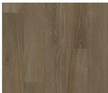
Albany | SCLA0205