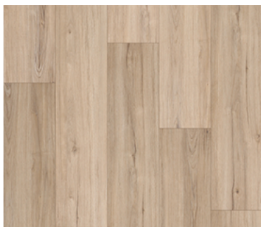
Augusta | SCLA0202