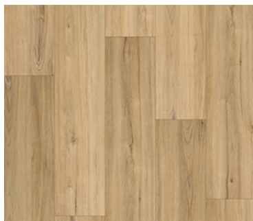
Lansing | SCLA0203