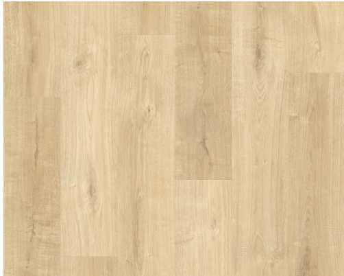
Topeka | SCLA0201