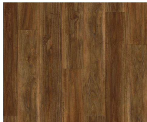
Calla Acacia | WIRC0506