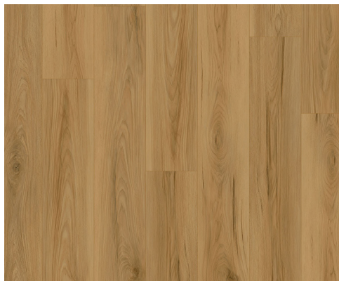
Lager Hickory | WIRC0502