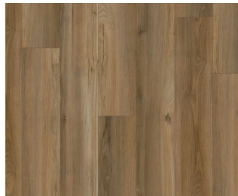
Porter Hickory | WIRC0503