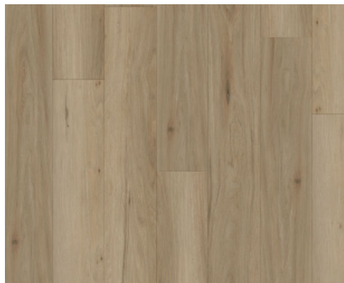
Tanunda Hickory | WIRC0501