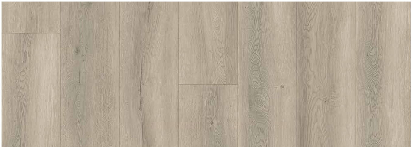
SOLSTICE LUXURY VINYL TILE