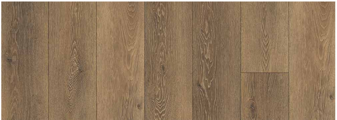
TARA LUXURY VINYL TILE