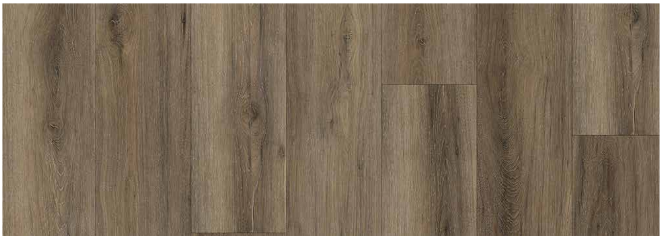
MELODY LUXURY VINYL TILE