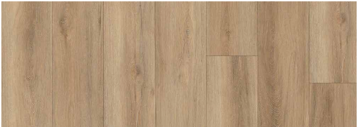
BYRON LUXURY VINYL TILE