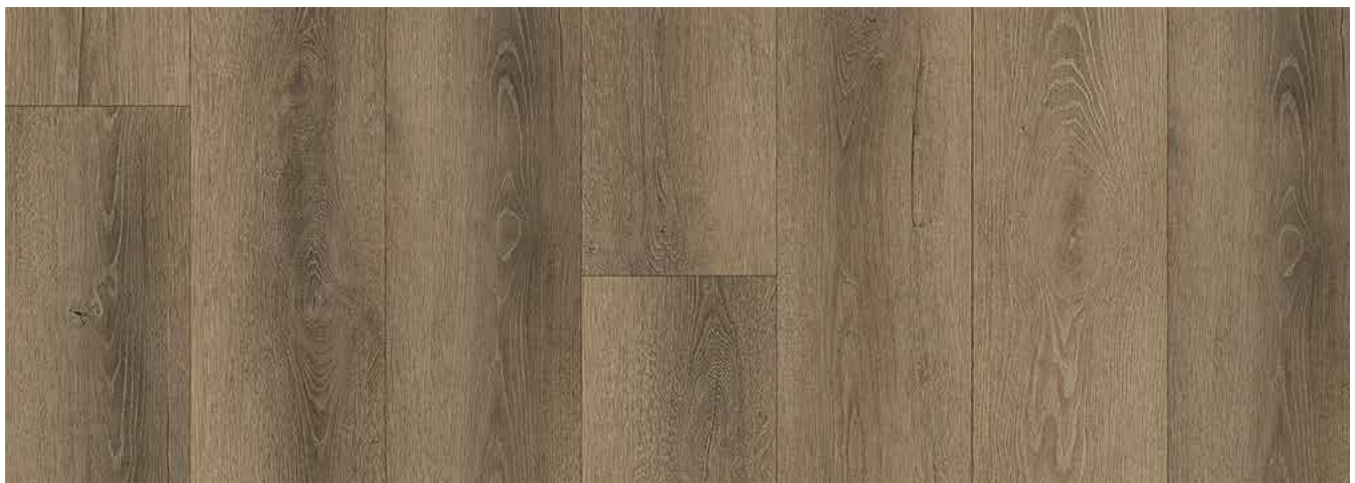
ASHWORTH LUXURY VINYL TILE