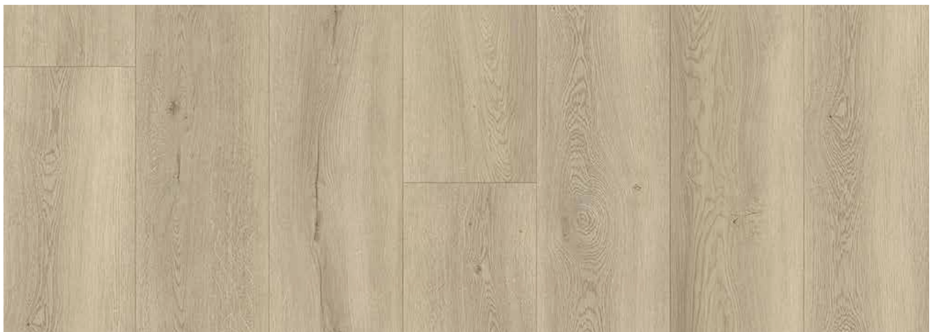
HOBART LUXURY VINYL TILE