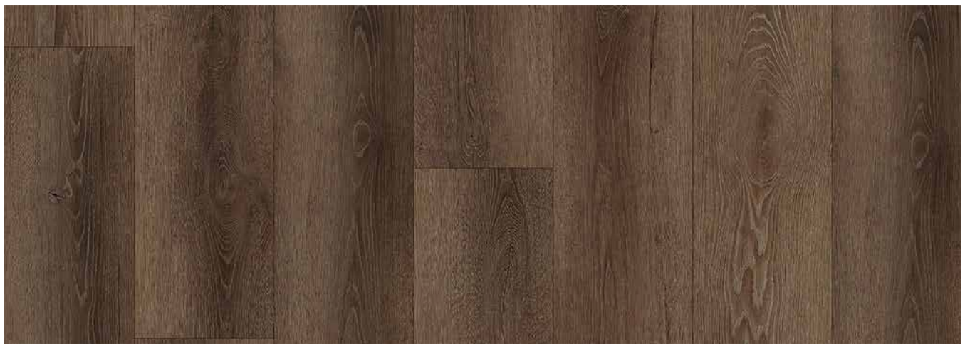
LAYTON LUXURY VINYL TILE