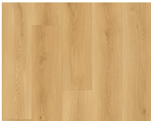
Newberry | SCLA0104