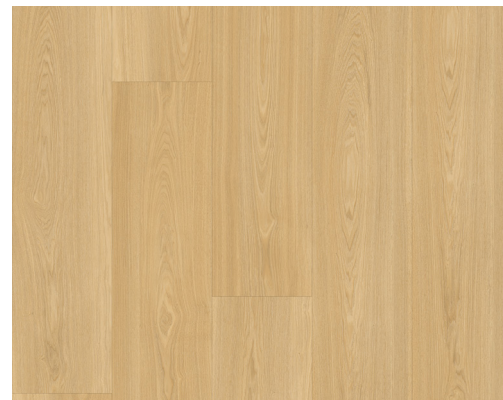
Stanwick | SCLA0103