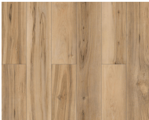
McHenry | SCLA0102