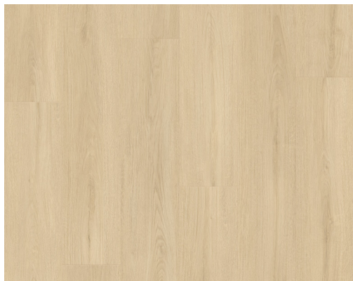
Cabrillo | SCLA0101