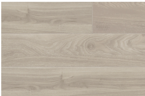
Rockport | JBTANDEMROC