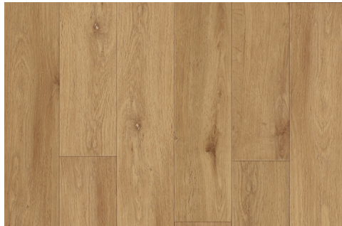
Norwich | JBTANDEMNR