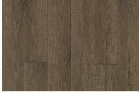
Ashford | JBTANDEMASH