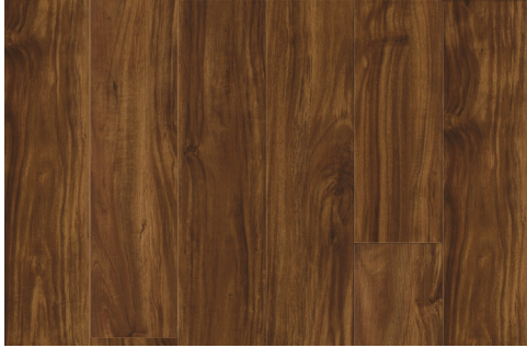
Acacia | JBTANDEMACAAT