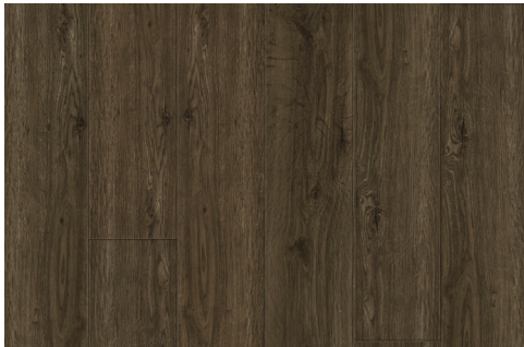
Glasgow | JBTANDEMGLA