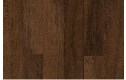
Dover | JBTANDEMDOV