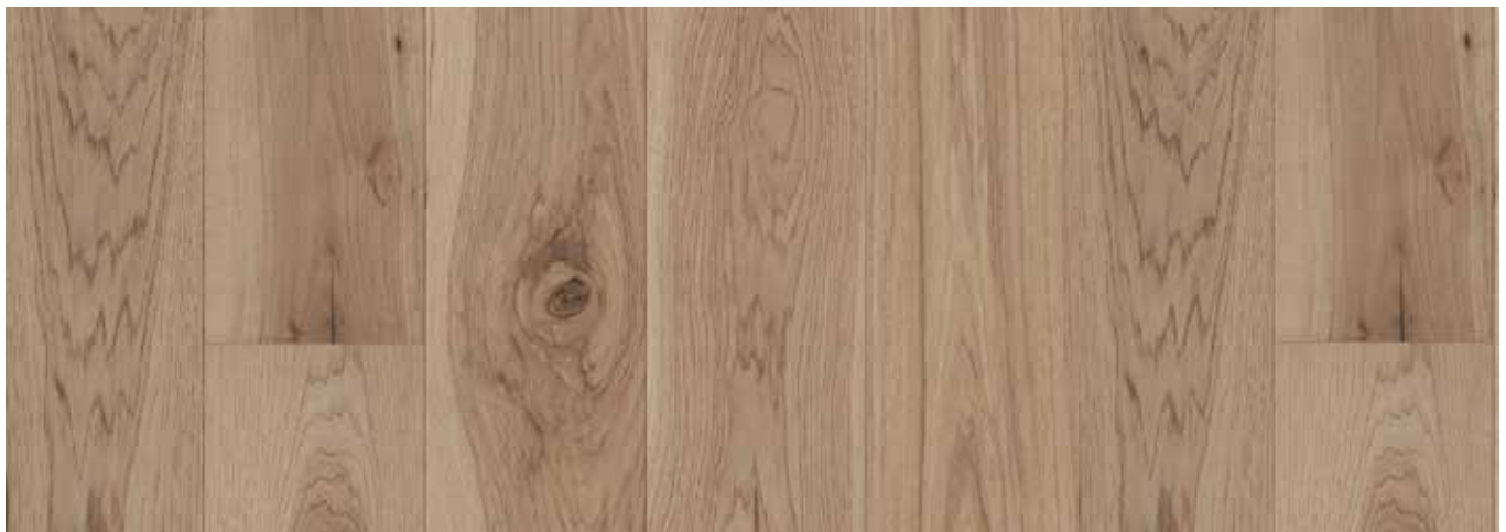
HYPERIAN HYBRID HARDWOOD