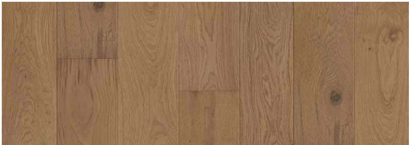
RHEA HYBRID HARDWOOD