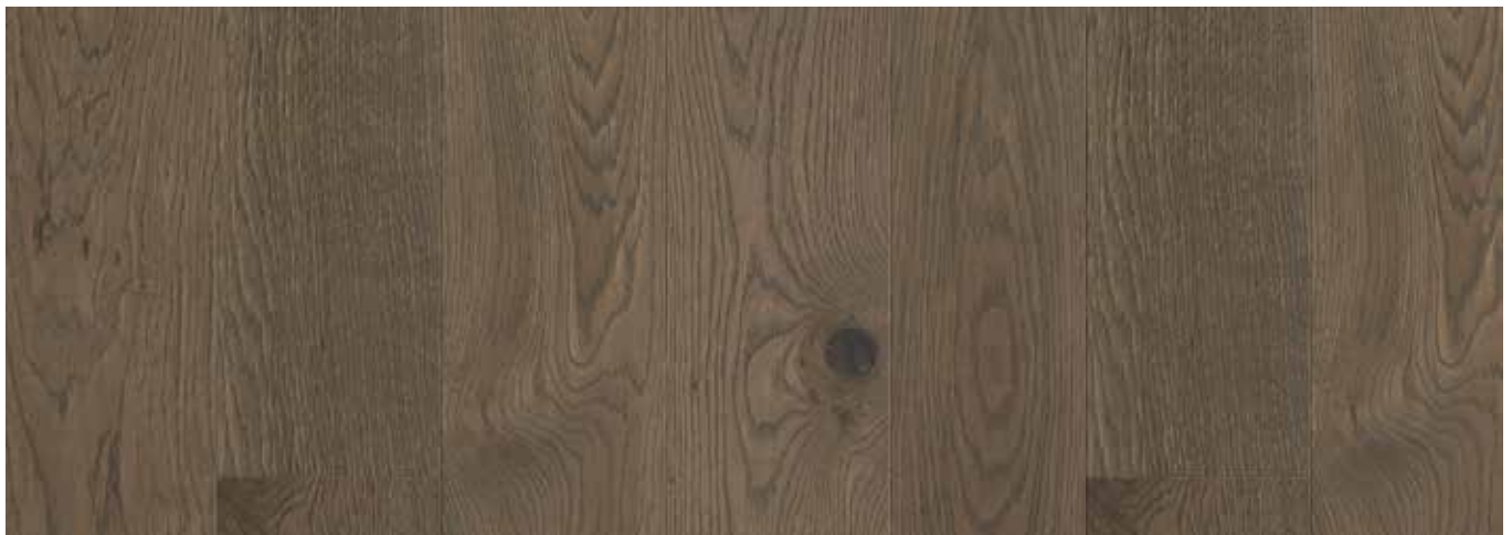
OCEANUS HYBRID HARDWOOD