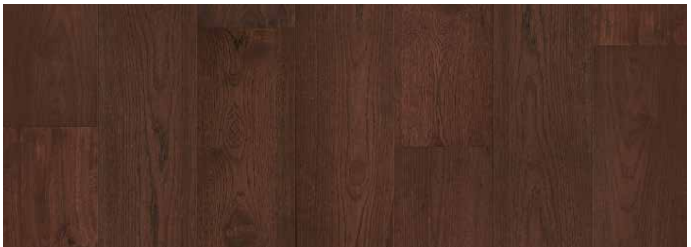
CRONUS HYBRID HARDWOOD