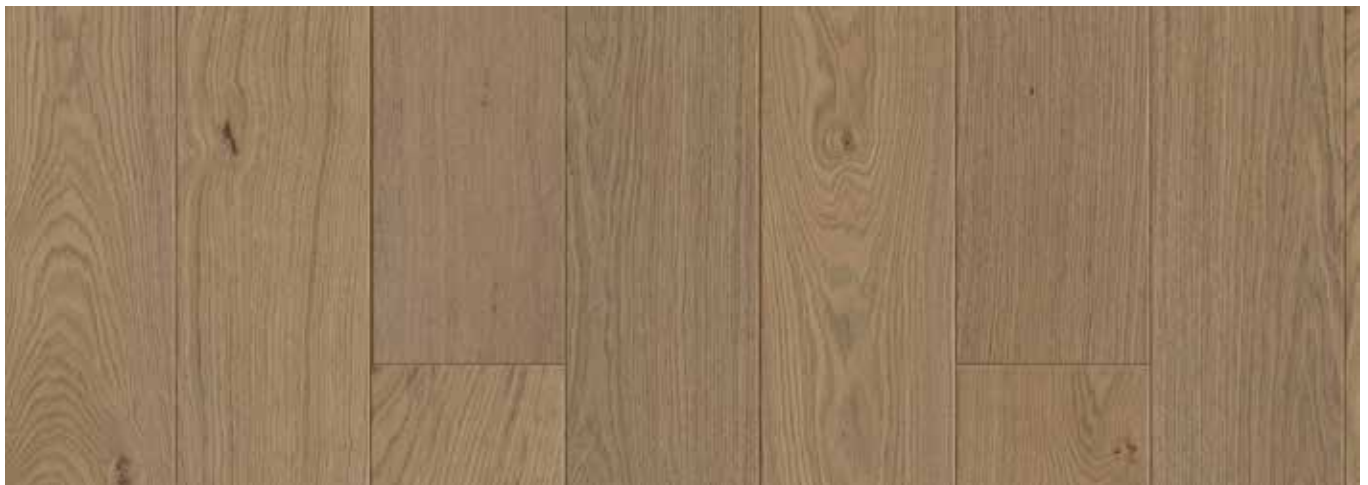
TETHYS HYBRID HARDWOOD