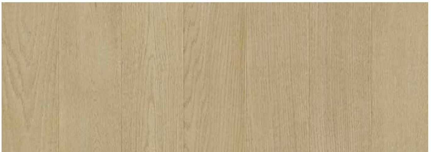
THEMIS HYBRID HARDWOOD