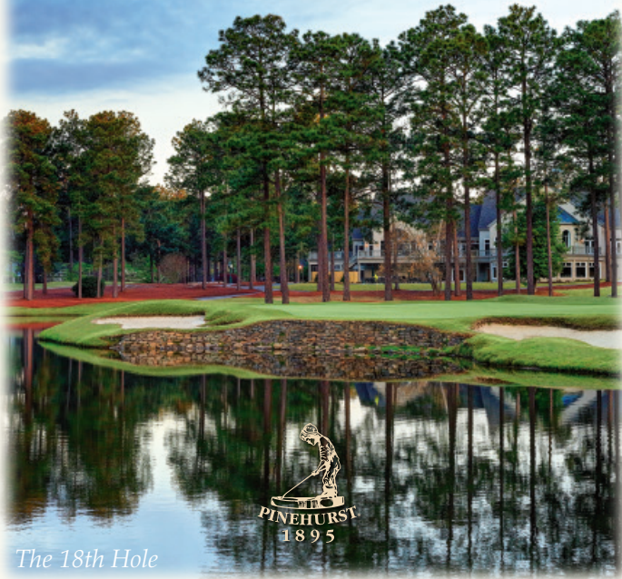
The 18th Hole

A Jack Nicklaus Design Established in 1989