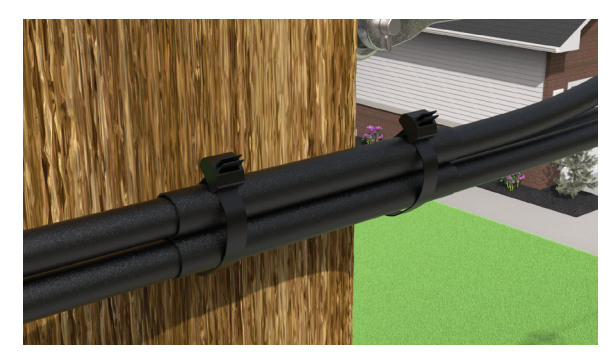
Cable Abrasion Protectors Installed on Cables

The Abrasion Protector Kit and Uni-Group Cable Guide are optional accessories that help protect slack cable when passing a pole. Please refer to Section 5 of the Ordering Information table to select the appropriate cable protection option for you application.