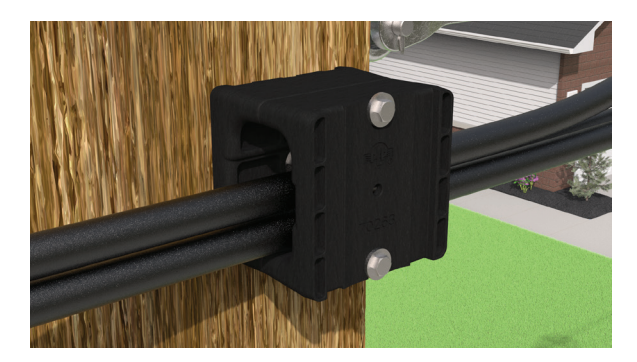
Uni-Group Cable Guide Installed on Wood Pole