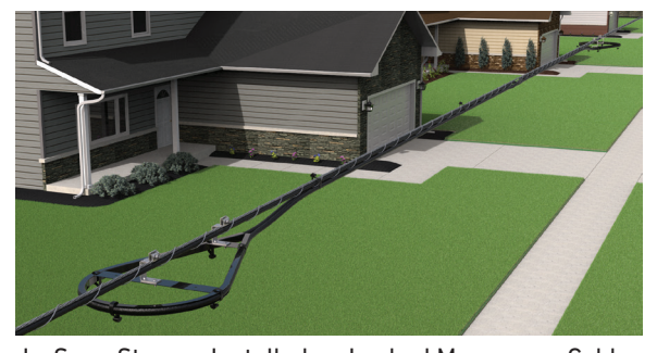
\hbox{In-Span Storage Installed on Lashed Messenger Cable}

The SLACKLOOP Aluminum In-Span Storage easily mounts to either lashed messenger or ADSS cable by using the application-specific hanger brackets supplied with each in-span system. Please refer to Section 2 of the Ordering Information table to select the appropriate hanger bracket kit for you application.