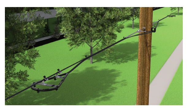
In-Span Storage Installed on ADSS Cable