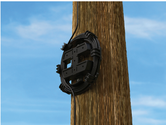
SLACKLOOP Drop Cable Storage Mounted on Wood Pole