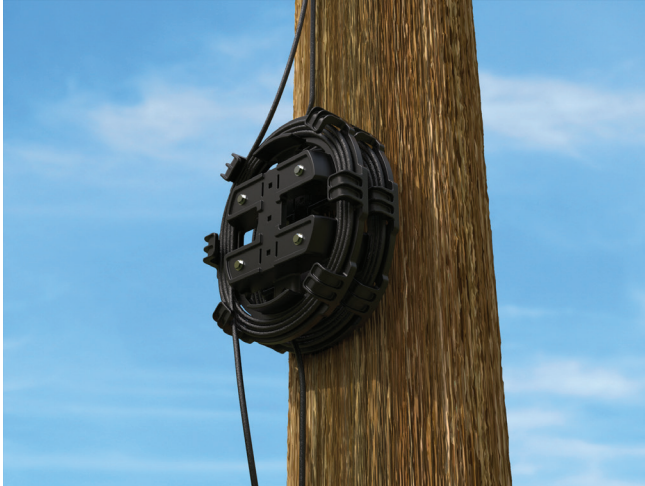
Standard Stacking of SLACKLOOP Drop Cable Storage using the Stacking Kit ( Catalog Number: 7400030 )