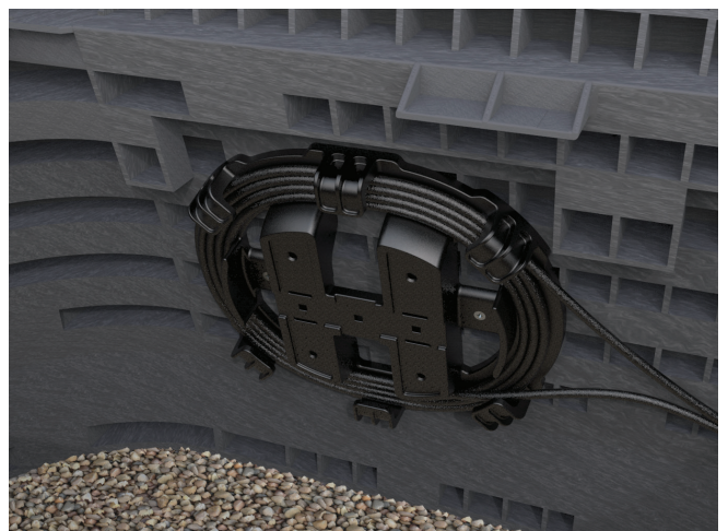
SLACKLOOP Drop Cable Storage in Handhole