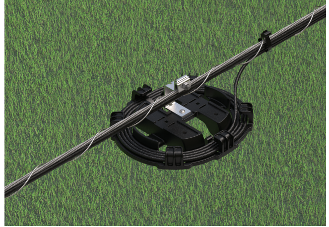
SLACKLOOP Drop Cable Storage Mounted on Messenger