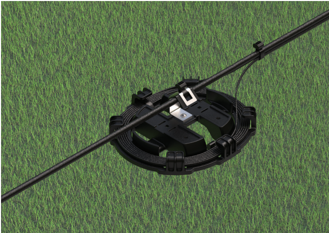
SLACKLOOP® Drop Cable Storage Mounted on ADSS Cable