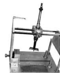
POWER END PLATE CUTTER