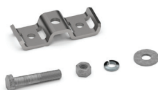
Catalog Number: 710010576 Banding Bracket Kit 1,2 (Suffix Code: B1)