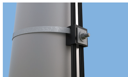
FIBERLIGN Download Cushion for Flat Drop Cable Mounted to Steel Pole (Suffix Code: H)