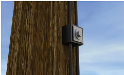
FIBERLIGN Download Cushion for Round Cable Mounted to Wood Pole (Suffix Code: H1)