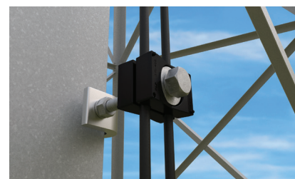
FIBERLIGN Download Cushion for Round Cable Mounted to Lattice Tower (Suffix Code: LTC1)