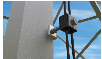
FIBERLIGN Download Cushion for Round Cable Mounted to Lattice Tower (Suffix Code: LTC1)