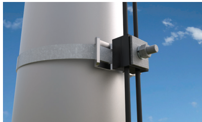
FIBERLIGN Download Cushion for Round Cable Mounted to Steel Pole (Suffix Code: B1)