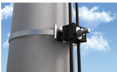
FIBERLIGN Download Cushion for Round Cable Mounted to Steel Pole (Suffix Code: B1)