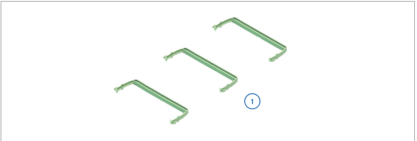
1. Copper Waterfall Handles (3)