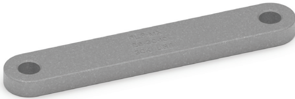
30,000 lb Extension Strap - 10" (Catalog Number: ES-30-10)