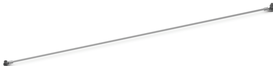
5 ft (1.5 m) Long 95mm 2 (19W) Aluminum Ground Wire Assembly (Catalog Number: 710011205)