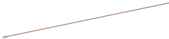
4 ft (1.2 m) Long #4 (7W) Copper Ground Wire Assembly (Catalog Number: 710010016)