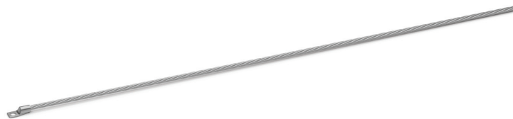
4 ft (1.2 m) Long 4/0 (7W) Aluminum Ground Wire Assembly (Catalog Number: 710010294)