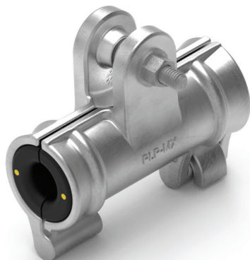
FIBERLIGN Aluminum Suspension* *Includes one complete insert (comprised of two Insert Halves)

For sizes greater than 1.050", contact PLP about the Legacy FAS