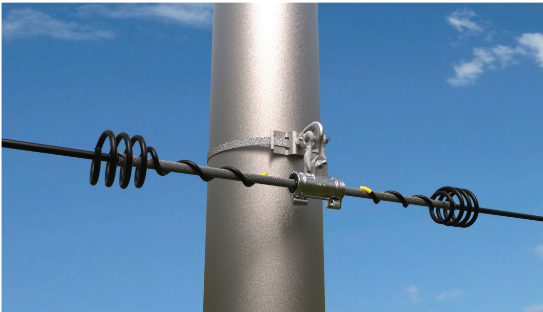
FIBERLIGN® ADSS-CORONA™ Coil Applied on SRR