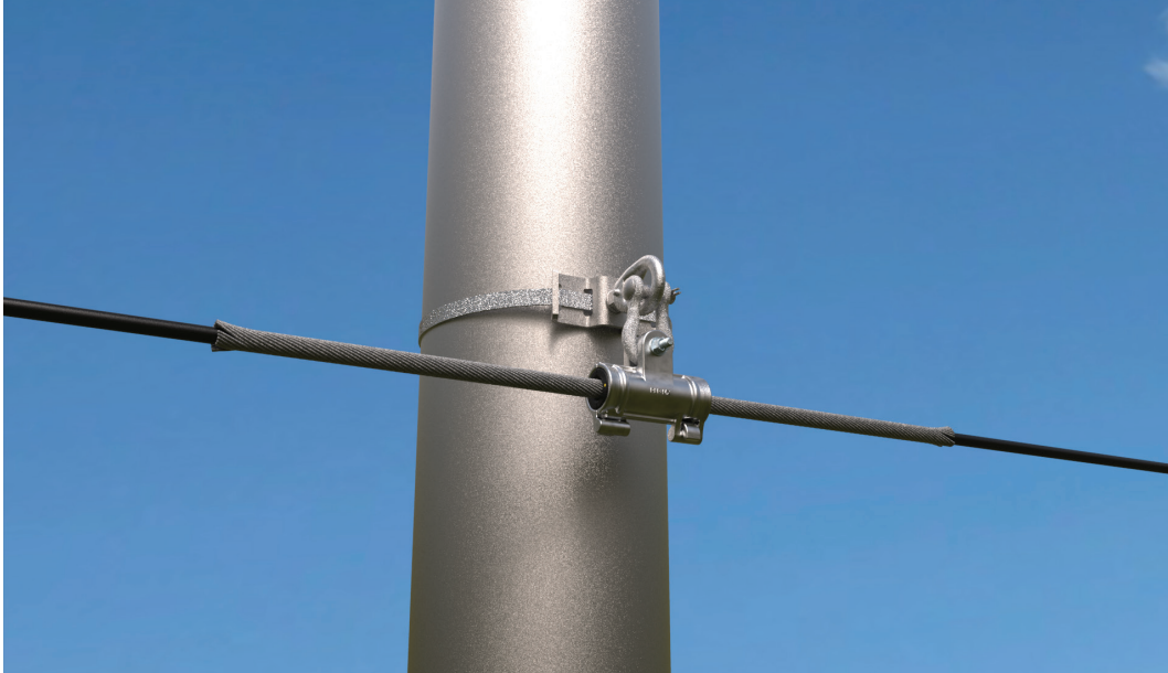
FASN with SRR