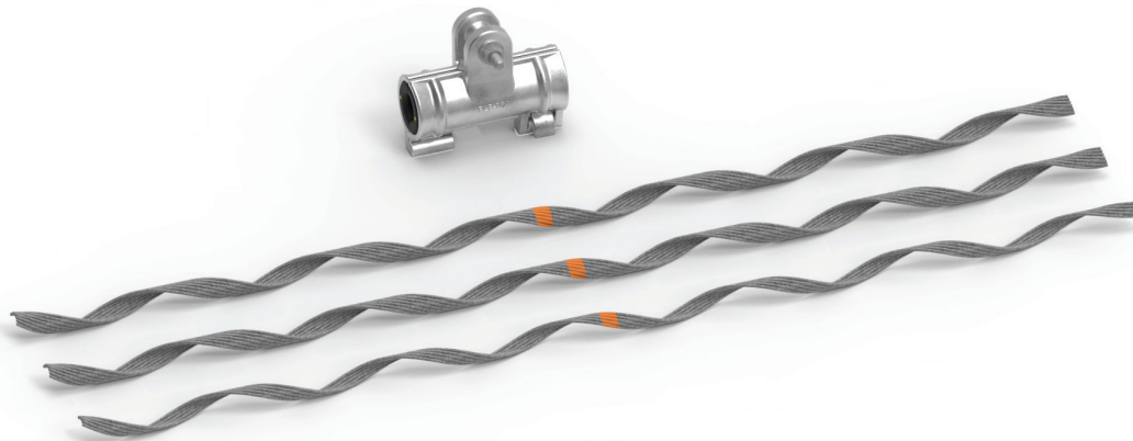
FIBERLIGN Aluminum Suspension for Cushion Inserts with SRR*

* Includes one complete insert (comprised of two Insert Halves)