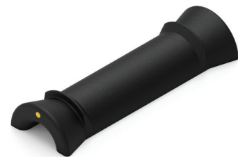
FIBERLIGN Aluminum Suspension Cushion Insert Half