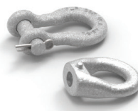
Anchor Shackle & 5/8"-11 Eye Nut