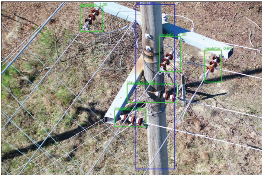
ADVANCED PROCESSING USING ARTIFICIAL INTELLIGENCE