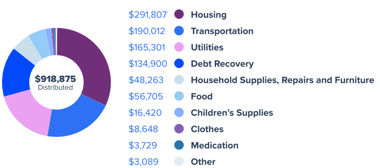
Figure 2: Breakdown of Funds Distribution by Category

The top four social needs were housing, transportation, utilities, and financial assistance, representing 86 percent of all funds distributed.