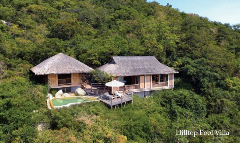
Hilltop Pool Villa