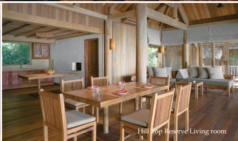
Hill Top Reserve Living room