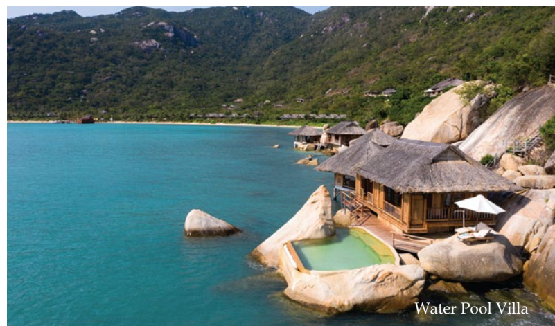
Water Pool Villa