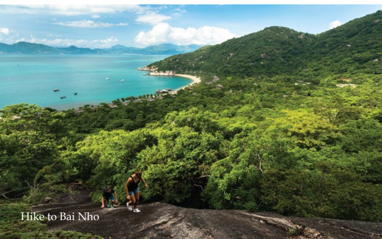
Hike to Bai Nho

Cruise the Nha Phu Bay on a traditional wooden boat with an chilled bottle of Sparkling Wine and accompanying nibbles. Toast to the sun as it slips beyond the South Vietnamese Sea, setting the perfect moment to pop the question or to enjoy an intimate moment together.