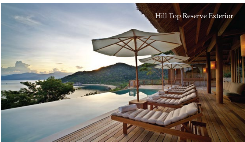
Hill Top Reserve Exterior