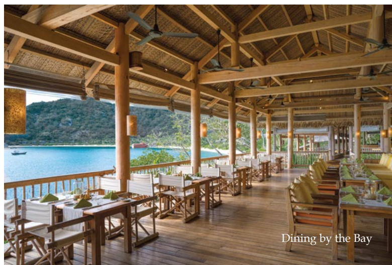
Dining by the Bay

The restaurant's open and airy design allows you to marvel at the starry night sky and the radiant moon, unobstructed by anything around you. With both indoor and outdoor seating, each area accommodating 24 guests, it offers the perfect setting for a romantic or intimate dining experience, making it a must-visit during your stay at Six Senses Ninh Van Bay.