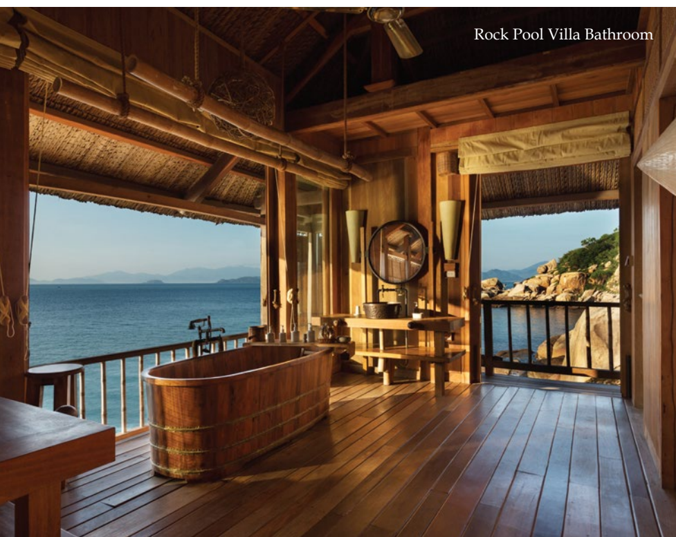
Rock Pool Villa Bathroom