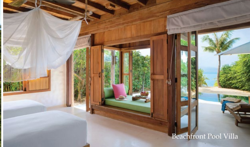
Beachfront Pool Villa