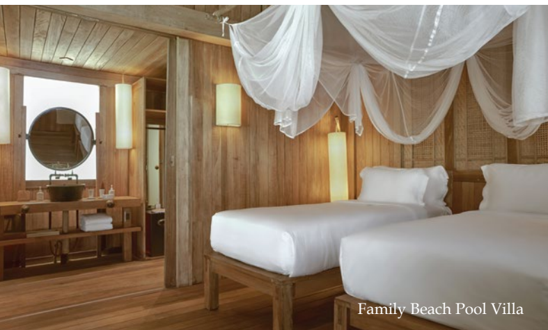
Family Beach Pool Villa