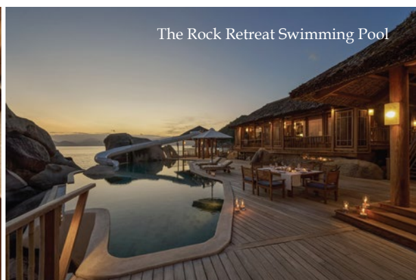
The Rock Retreat Swimming Pool