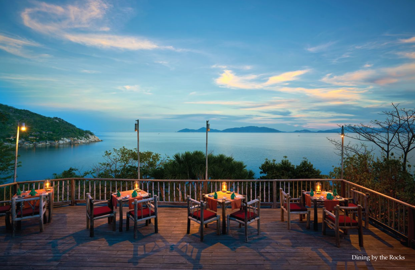
Dining by the Rocks