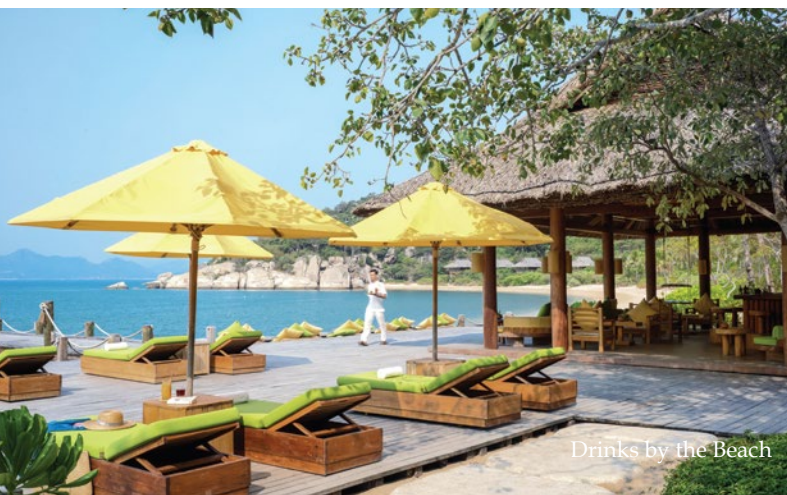
Drinks by the Beach

Located at the main pier, just a few steps away from the cool, refreshing water. Here, guests come to relax. With an open design featuring a mix of seating that allows you to choose between lounging in the nets or sitting while enjoying your favorite drinks. Notably, you can savor refreshing cold draft beers or “story cocktails”.