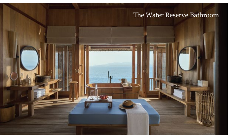
The Water Reserve Bathroom