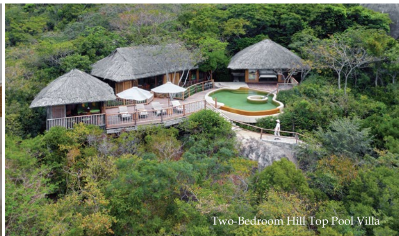
Two-Bedroom Hill Top Pool Villa