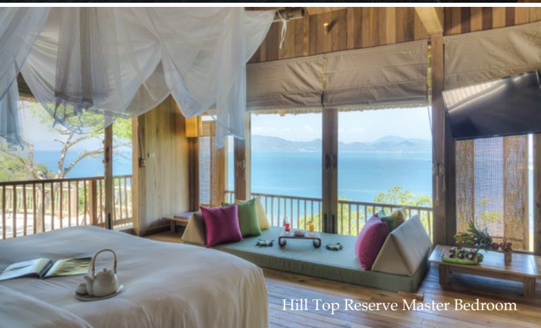
Hill Top Reserve Master Bedroom