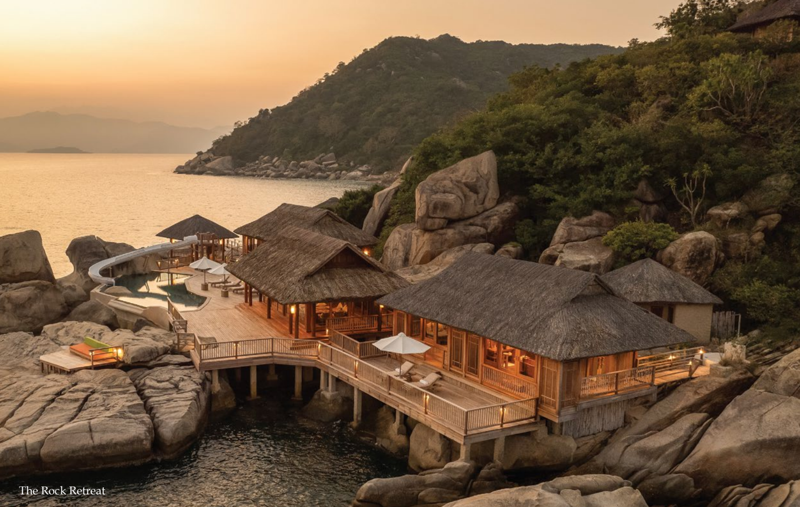
The Rock Retreat