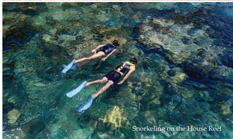
Snorkeling on the House Reef