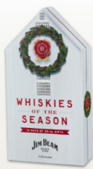
4. Jim Beam Whiskies of the Season