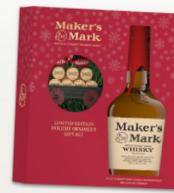
11. Maker's Mark Bourbon with Ornament