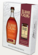
7. Elijah Craig Old Fashioned Cocktail Kit