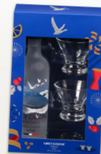
9. Grey Goose with Glasses