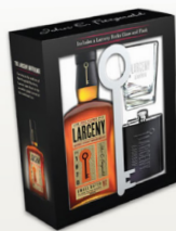
5. Larceny with Flask & Glass