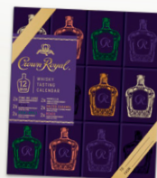
10. Crown Royal Whisky Calendar Set