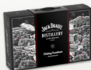
2. Jack Daniel Holiday Countdown Calendar