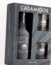
12. Casamigos Mezcal with Glasses