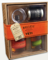
1. Bulleit Yeti Gift Pack

One of the hottest gift trends in the spirits industry is "value-added packaging" (VAPs) – these gifting items are offered as a free bonus at the same price as the bottle alone. We've featured 12 great gifts , but there are many more available at your favorite store! Supplies are limited, so pick up one now for yourself and everyone on your list.