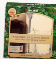
8. Bacardi Reserva Ocho Old Fashioned Mixing Kit