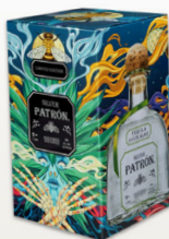
6. Silver Patrón Collectors Tin