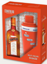
3. Cointreau Liqueur with Shaker