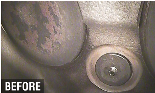
INJECTOR & COMBUSTION CHAMBER

NOTE: The following images on this vehicle were captured after running a full tank of fuel.