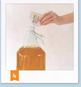
Add the yeast and carefully swirl to mix.