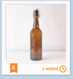
Seal and ferment for 2 weeks at room temperature (20°C/68°F).