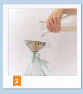
Add to the fermenting jar.