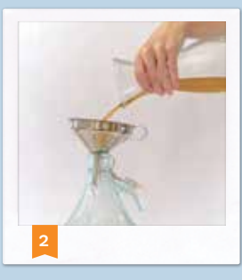
Add to the fermenting jar.