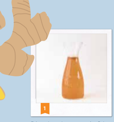
Dissolve the sugar in 2 L (2 US qt) of warm water and mix in the ginger and lemon juice.