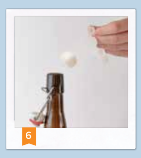
Use the 0.75 scoop on the 3-way sugar measurer to add 1 scoop of white sugar to each bottle.