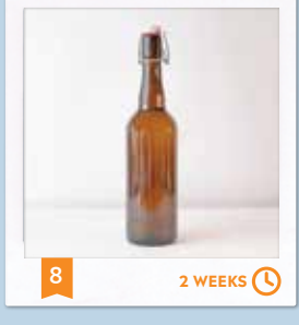
Pour the ginger beer into bottles. Seal and ferment for 2 weeks at room temperature (20°C/68°F).