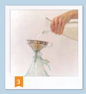
Top up the fermenting jar with remaining water.