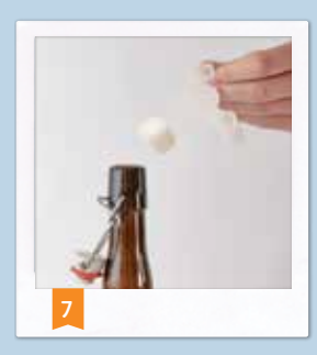
Use the 0.75 scoop on the 3-way sugar measurer to add 1 scoop of white sugar to each bottle.