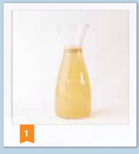
Mix the ginger and lemon juice in 2 L (2 US qt) of warm water.