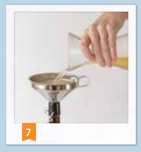
Pour the ginger beer into bottles using the jug.