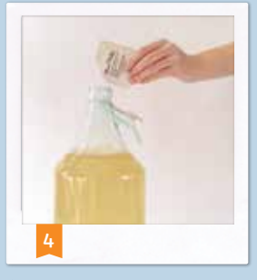
Add the yeast and carefully swirl to mix.