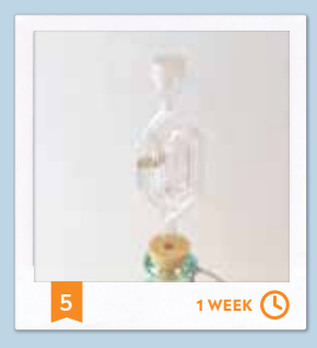
Half fill the airlock with water and fit to the top. Ferment for 1 week at room temperature (20°C/68°F).