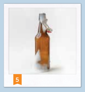
Sterilise 6 x 750 mL glass bottles, a jug, and a funnel with boiling water.