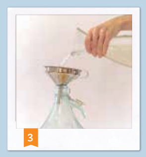
Top up the fermenting jar with remaining water.