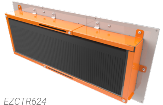
EZCTR624 with Slim Mounting Frames

EZ Path ® Cable Tray Retrofit Devices are available to accommodate varying cable tray widths from 12 in to 24 in. No additional putty or sealant is required for installation.