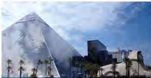
THE LUXOR HOTEL AND CASINO - LAS VEGAS, NV