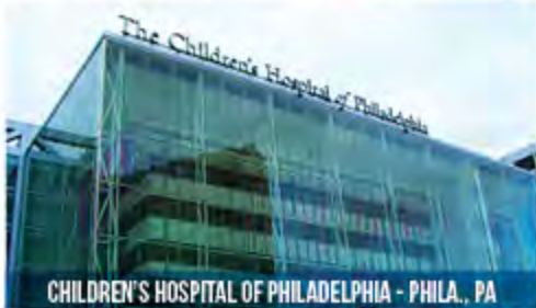
CHILDREN'S HOSPITAL OF PHILADELPHIA - PHILA., PA