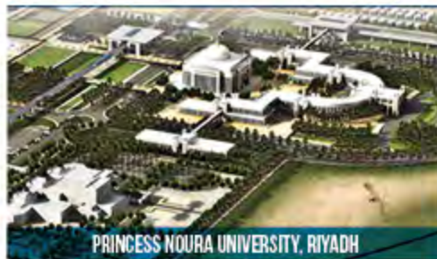
PRINCESS NOURA UNIVERSITY, RIYADH