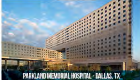
PARKLAND MEMORIAL HOSPITAL - DALLAS, TX