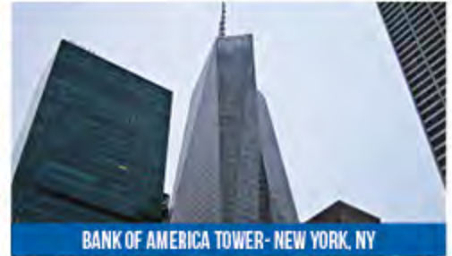
BANK OF AMERICA TOWER - NEW YORK, NY