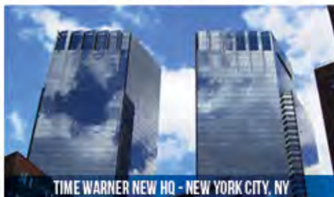
TIME WARNER NEW HQ - NEW YORK CITY, NY