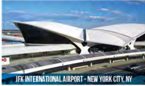
JFK INTERNATIONAL AIRPORT - NEW YORK CITY, NY