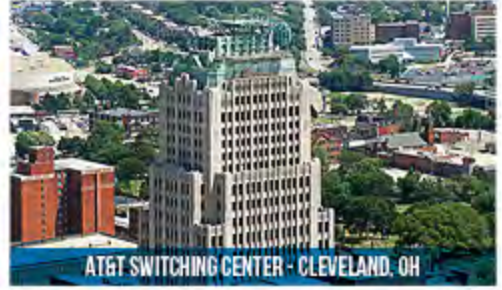
AT&T SWITCHING CENTER - CLEVELAND, OH