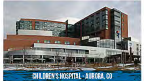
CHILDREN'S HOSPITAL - AURORA, CO