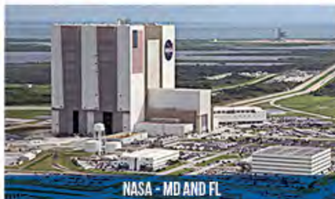
NASA - MD AND FL