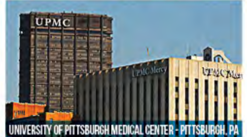
UNIVERSITY OF PITTSBURGH MEDICAL CENTER - PITTSBURGH, PA