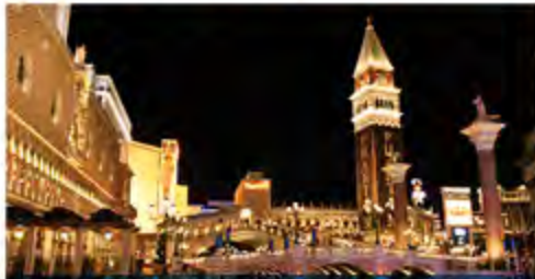
THE VENETIAN HOTEL AND CASINO - LAS VEGAS, NV