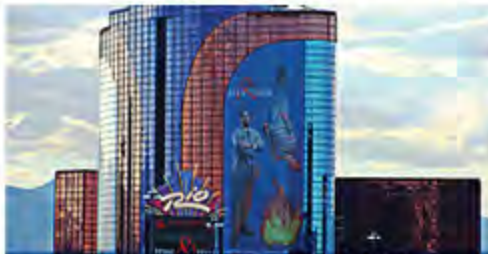
RIO HOTEL AND CASINO - LAS VEGAS, NV