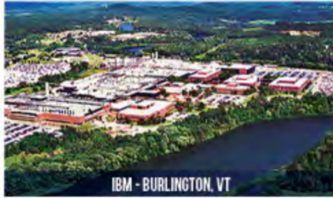
IBM - BURLINGTON, VT