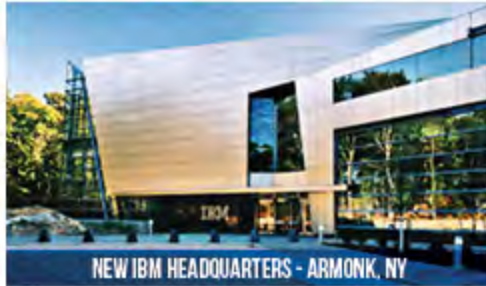
NEW IBM HEADQUARTERS - ARMONK, NY