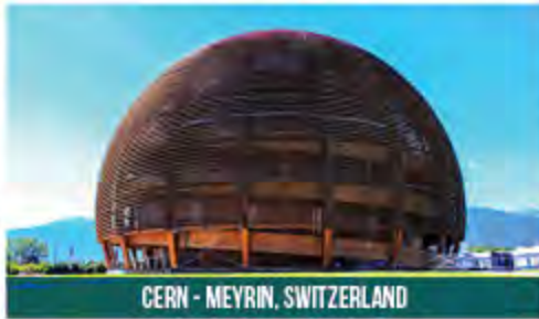
CERN - MEYRIN, SWITZERLAND