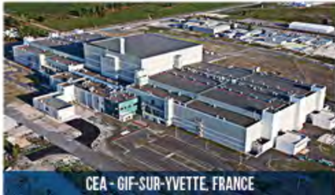
CEA - GIF-SUR-YVETTE, FRANCE