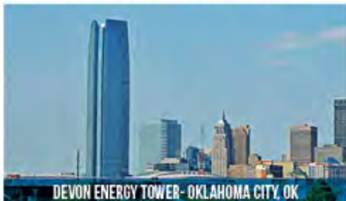
DEVON ENERGY TOWER - OKLAHOMA CITY, OK