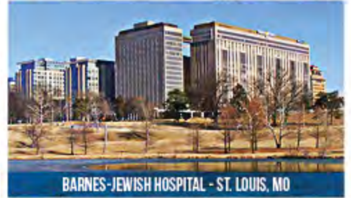
BARNES-JEWISH HOSPITAL - ST. LOUIS, MO