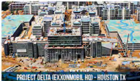
PROJECT DELTA (EXXONMOBIL HQ) - HOUSTON TX