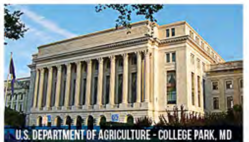
U.S. DEPARTMENT OF AGRICULTURE - COLLEGE PARK, MD