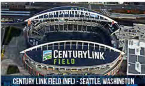
CENTURY LINK FIELD (NFL) - SEATTLE, WASHINGTON