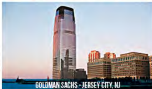
GOLDMAN SACHS - JERSEY CITY, NJ