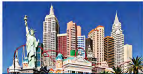
NEW YORK, NEW YORK HOTEL AND CASINO - LAS VEGAS, NV