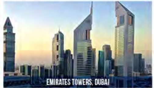
EMIRATES TOWERS, DUBAI