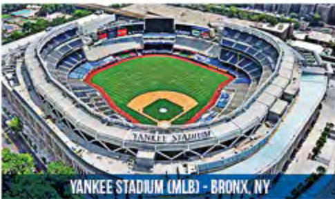
YANKEE STADIUM (MLB) - BRONX, NY