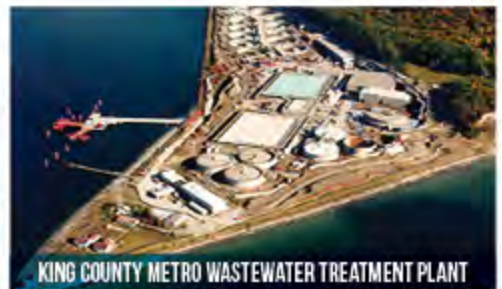
KING COUNTY METRO WASTEWATER TREATMENT PLANT