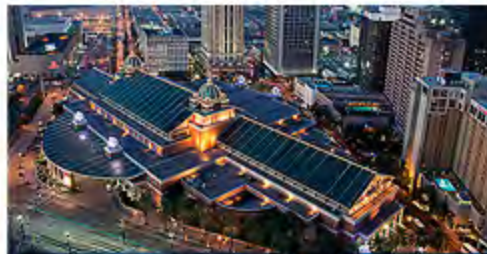
HARRAH'S - NEW ORLEANS, LA