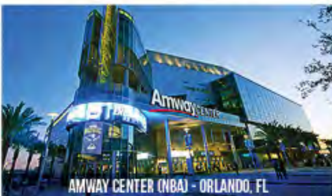
AMWAY CENTER (NBA) - ORLANDO, FL