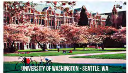
UNIVERSITY OF WASHINGTON - SEATTLE, WA