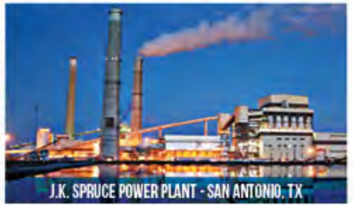
J.K. SPRUCE POWER PLANT - SAN ANTONIO, TX