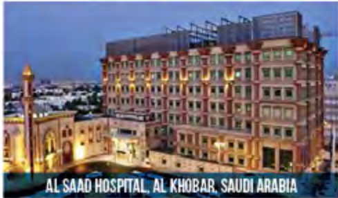
AL SAAD HOSPITAL, AL KHOBAR, SAUDI ARABIA