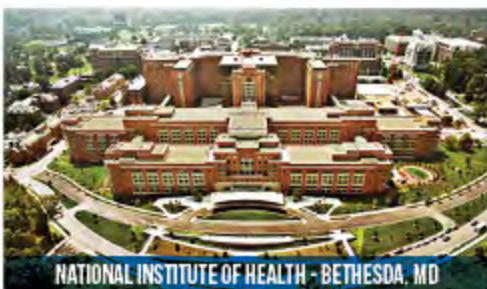
NATIONAL INSTITUTE OF HEALTH - BETHESDA, MD