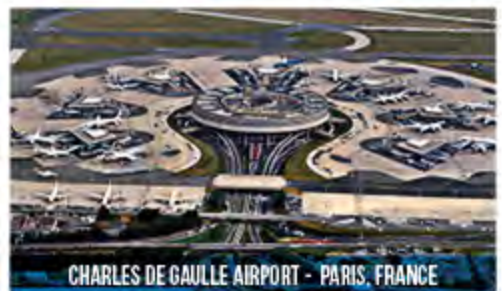
CHARLES DE GAULLE AIRPORT - PARIS, FRANCE