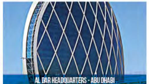
AL DAR HEADQUARTERS - ABU DHABI