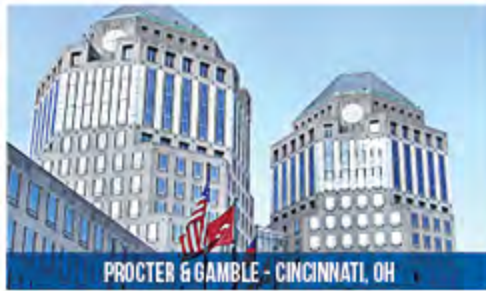
PROCTER & GAMBLE - CINCINNATI, OH