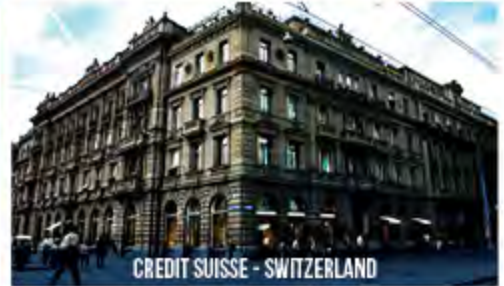
CREDIT SUISSE - SWITZERLAND