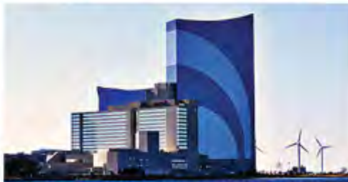
HARRAH'S HOTEL AND CASINO - ATLANTIC CITY, NJ