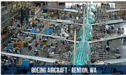
BOEING AIRCRAFT - RENTON, WA