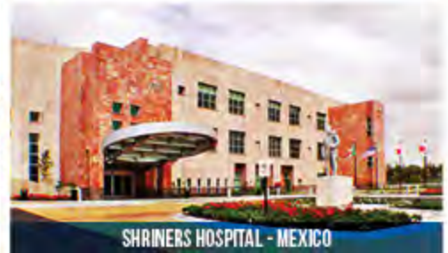
SHRINERS HOSPITAL - MEXICO