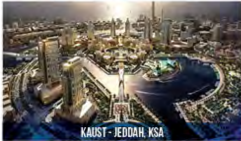
KAUST - JEDDAH, KSA