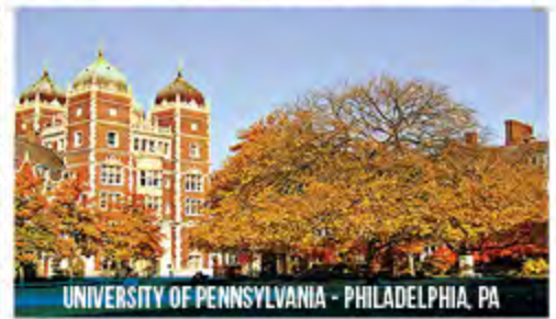
UNIVERSITY OF PENNSYLVANIA - PHILADELPHIA, PA