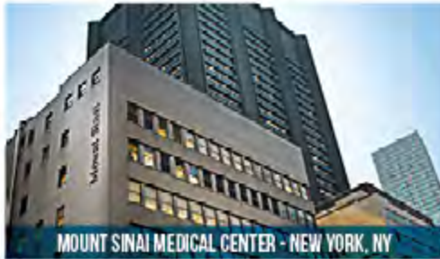
MOUNT SINAI MEDICAL CENTER - NEW YORK, NY