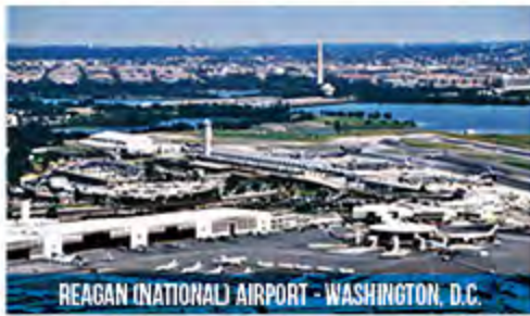
REAGAN (NATIONAL) AIRPORT - WASHINGTON, D.C.