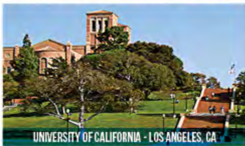
UNIVERSITY OF CALIFORNIA - LOS ANGELES, CA