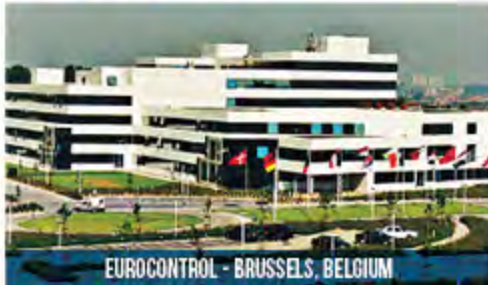
EUROCONTROL - BRUSSELS, BELGIUM