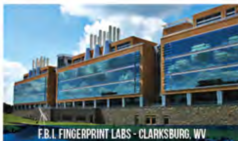
F.B.I. FINGERPRINT LABS - CLARKSBURG, WV