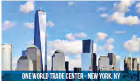
ONE WORLD TRADE CENTER - NEW YORK, NY