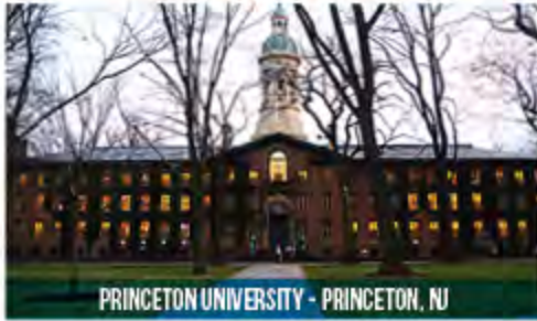
PRINCETON UNIVERSITY - PRINCETON, NJ