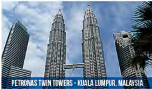
PETRONAS TWIN TOWERS - KUALA LUMPUR, MALAYSIA