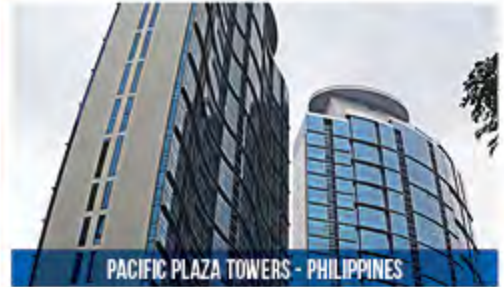
PACIFIC PLAZA TOWERS - PHILIPPINES