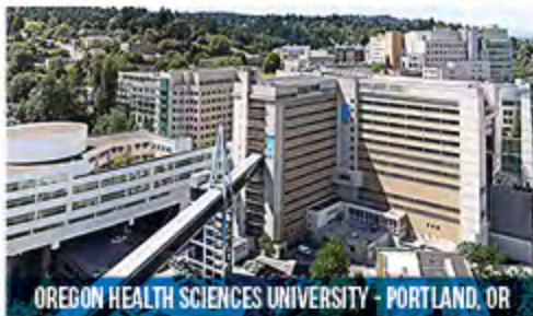
OREGON HEALTH SCIENCES UNIVERSITY - PORTLAND, OR