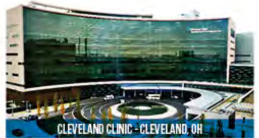
CLEVELAND CLINIC - CLEVELAND, OH