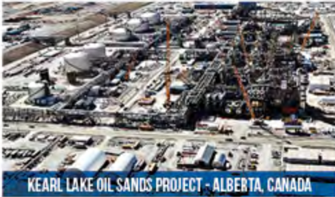
KEARL LAKE OIL SANDS PROJECT - ALBERTA, CANADA