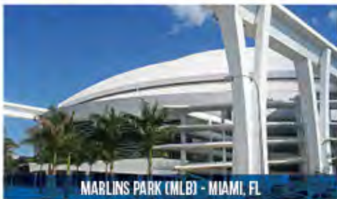
MARLINS PARK (MLB) - MIAMI, FL