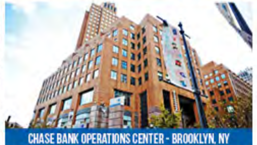
CHASE BANK OPERATIONS CENTER - BROOKLYN, NY