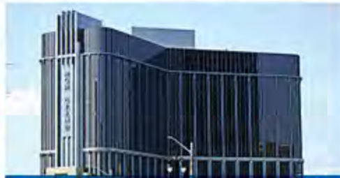
MGM CASINO & HOTEL - DETROIT, MI & SPRINGFIELD, MA