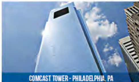
COMCAST TOWER - PHILADELPHIA, PA