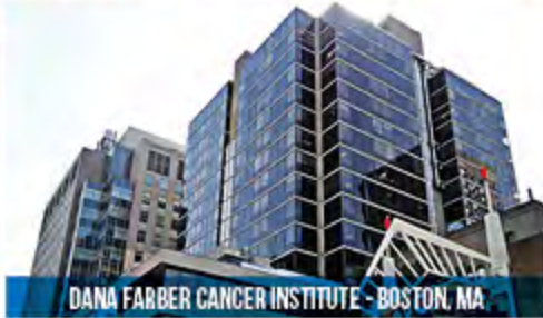
DANA-FARBER CANCER INSTITUTE - BOSTON, MA