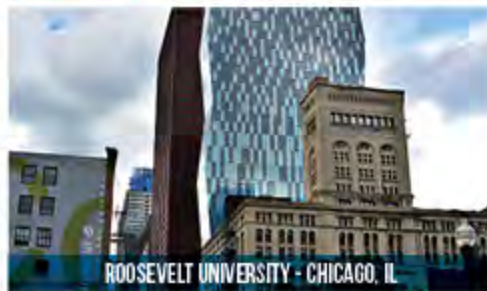
ROOSEVELT UNIVERSITY - CHICAGO, IL