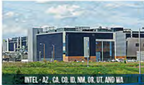
INTEL - AZ, CA, CO, ID, NM, OR, UT, AND WA