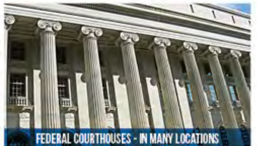
FEDERAL COURTHOUSES - IN MANY LOCATIONS