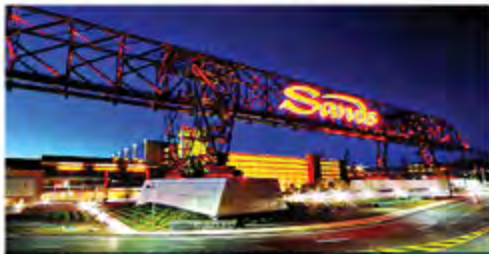
SANDS CASINO AND EVENT CENTER - BETHLEHEM, PA