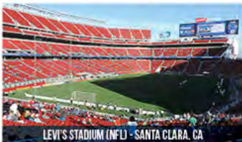
LEVI'S STADIUM (NFL) - SANTA CLARA, CA