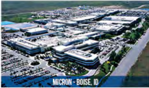
MICRON - BOISE, ID