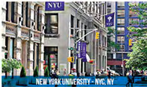
NEW YORK UNIVERSITY - NYC, NY