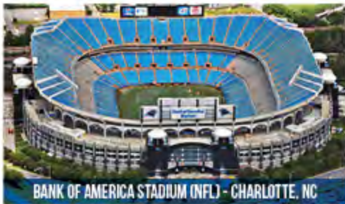
BANK OF AMERICA STADIUM (NFL) - CHARLOTTE, NC