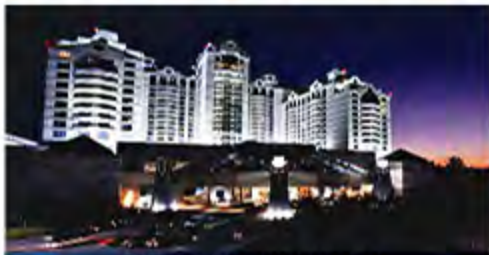
FOXWOODS - MASHANTUCKET, CT