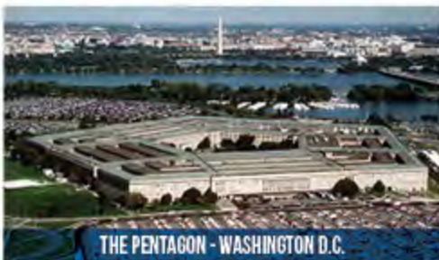
THE PENTAGON - WASHINGTON D.C.