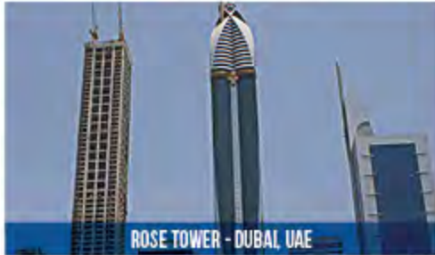
ROSE TOWER - DUBAI, UAE