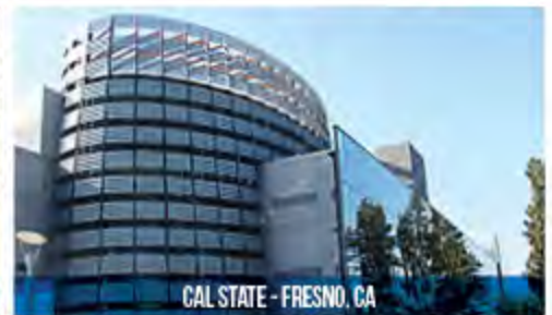
CAL STATE - FRESNO, CA