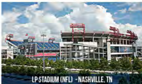
LP STADIUM (NFL) - NASHVILLE, TN