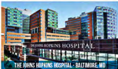
THE JOHNS HOPKINS HOSPITAL - BALTIMORE, MD