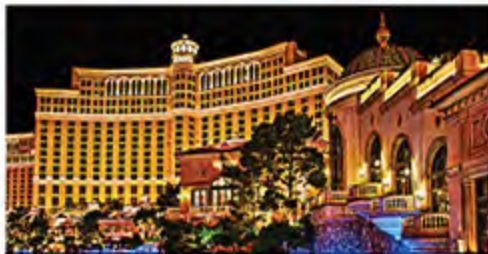
BELLAGIO HOTEL AND CASINO - LAS VEGAS, NV