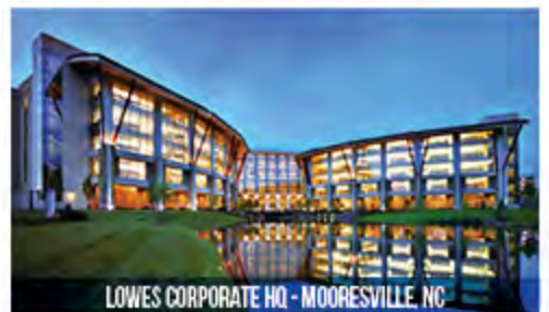
LOWES CORPORATE HQ - MOORESVILLE, NC