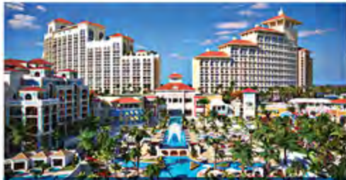
THE BAHA MAR CASINO & HOTEL - NASSAU, BAHAMAS