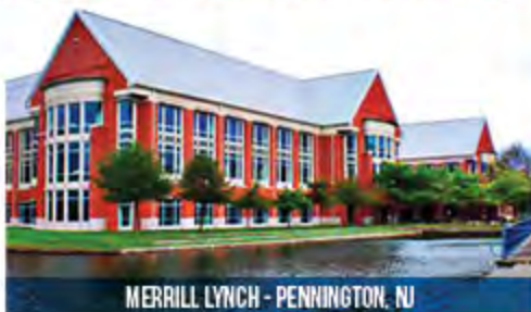
MERRILL LYNCH - PENNINGTON, NJ