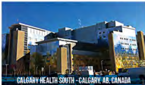
CALGARY HEALTH SOUTH - CALGARY, AB, CANADA