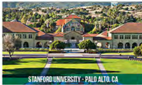
STANFORD UNIVERSITY - PALO ALTO, CA