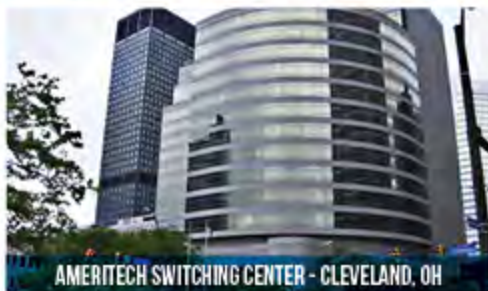
AMERITECH SWITCHING CENTER - CLEVELAND, OH