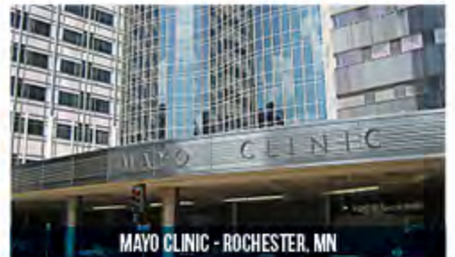
MAYO CLINIC - ROCHESTER, MN