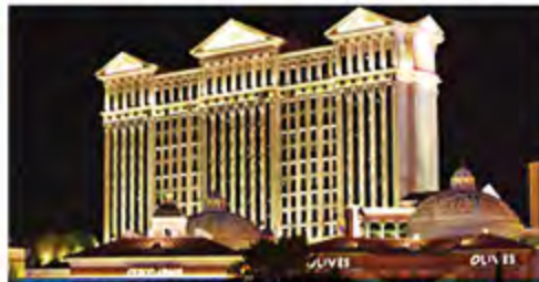
CAESARS PALACE HOTEL AND CASINO - LAS VEGAS, NV