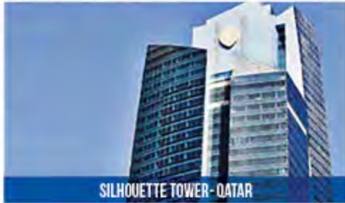
SILHOUETTE TOWER - QATAR