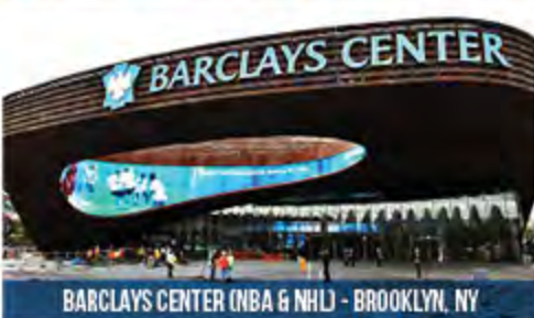
BARCLAYS CENTER (NBA & NHL) - BROOKLYN, NY