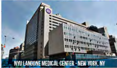
NYU LANGONE MEDICAL CENTER - NEW YORK, NY