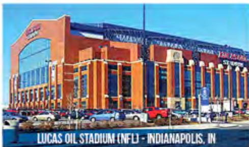
LUCAS OIL STADIUM (NFL) - INDIANAPOLIS, IN