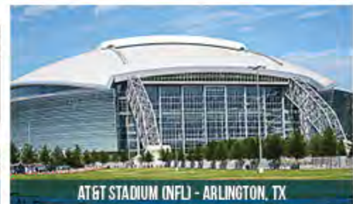
AT&T STADIUM (NFL) - ARLINGTON, TX