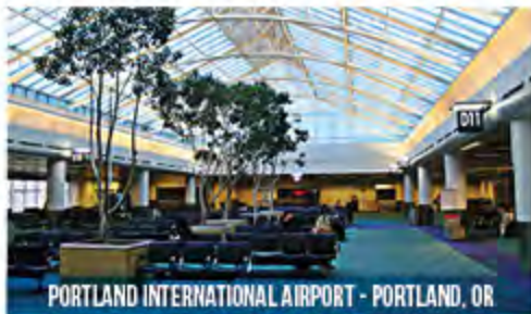
PORTLAND INTERNATIONAL AIRPORT - PORTLAND, OR