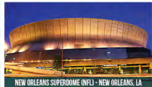
NEW ORLEANS SUPERDOME (NFL) - NEW ORLEANS, LA