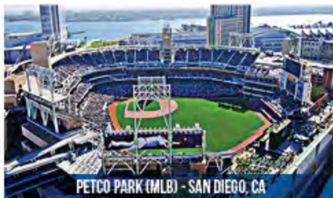
PETCO PARK (MLB) - SAN DIEGO, CA