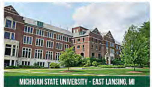
MICHIGAN STATE UNIVERSITY - EAST LANSING, MI