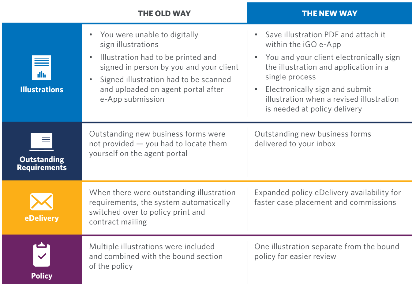
Illustration printing, in-person signing, and mail delays are now a thing in the past. Write and submit applications at a quicker pace, get more policies delivered electronically, and receive advanced commissions faster with our improved selling experience — no matter how you sell, in person or virtually.

For successful agents in the field, efficiency is the name of the game. That's why we're turbocharging your business with a fully digital application and policy eDelivery experience for Transamerica Financial Foundation IUL ® (FFIUL) on iGO® e-App.