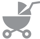
THE BIRTH OF A CHILD