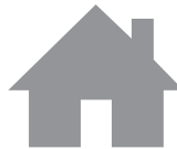
BUYING A HOME