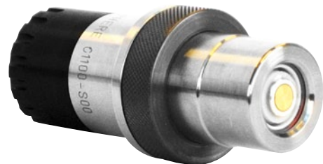
C1100 Ozone Sensor