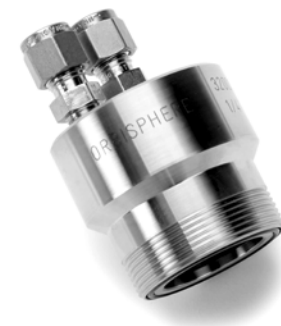
Orbisphere Flow Chamber (32001)