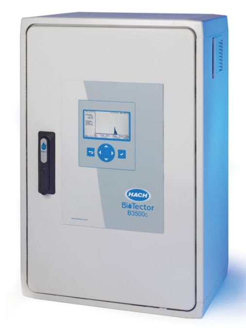
Hach's BioTector B3500c TOC analyzers provide maximum uptime and reliability due to their patented two-stage advanced oxidation process.

With an uptime of 99.86%, maintenance requirements are minimal. No calibration or ongoing maintenance is required in-between the recommended six-month service intervals.