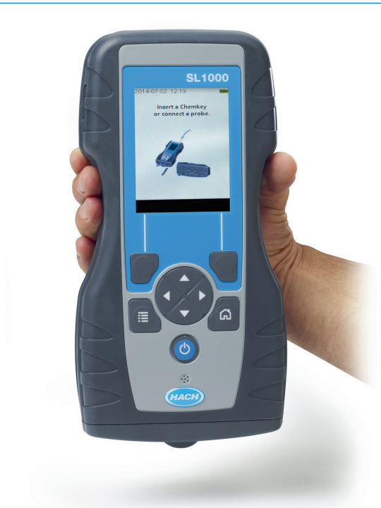
SL1000 Portable Parallel Analyzer