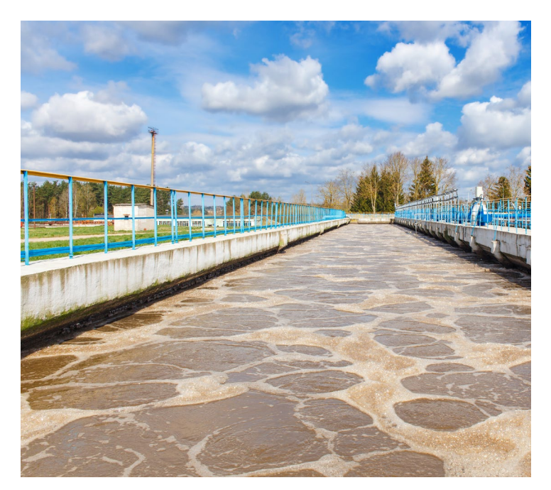
Biological treatment of wastewater

Without adequate nitrogen and phosphorus, bacteria are unable to completely break down complex toxic organic molecules into simpler, less harmful compounds. Even a slight nutrient deficiency can mean that toxic substances are passing through untreated into the final effluent, resulting in higher production costs for post-treatment chemical dosing, or potential fines and downtime resulting from exceeding permit values.