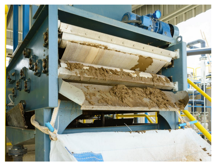
Sludge belt press

Most plants use high-pulp consistency meters to measure suspended solids and control their production. However, these meters are expensive, cannot measure low concentration and are bolted to the pipes without the option to perform maintenance during runtime.