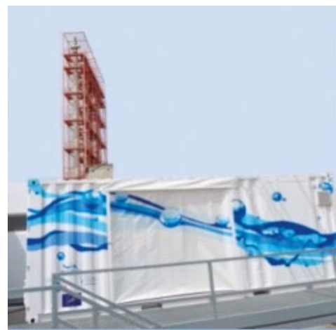
Figure 1: Destilerías Muñoz Gálvez's new facility

In order to effectively manage organic load elimination in wastewater treatment, it is necessary to have continuous organic monitoring, so that the process can be adjusted according to the actual organic load. This information is critical in determining when to end treatment.