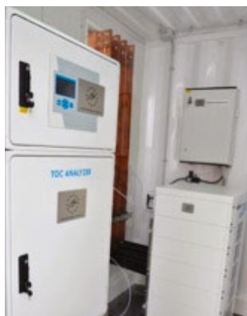
Figure 3: BioTector B7000 installed at the plant

The TOC measurements were used to record the elimination kinetics of organic matter during an electro-oxidation treatment for water previously treated with membranes. The values shown in Figure 4 demonstrate these organic matter elimination kinetics and enable the SCADA to adapt electro-oxidation operating parameters, such as the electrical charge supplied, to the instantaneous concentration of organic matter.