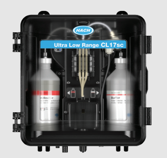
Ultra Low Range CL17sc with Standpipe Installation Kit PN9790200