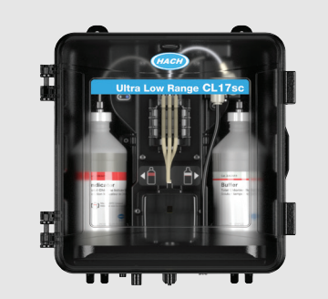
Ultra Low Range CL17sc with Pressure Regulator Installation Kit PN9790300