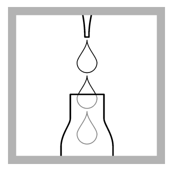
2. Carefully pipet 1.0 mL of solution A.