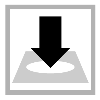
5. Insert the vial into the cell holder. DR 1900: Go to LCK/TNTplus methods. Select the test, push READ .