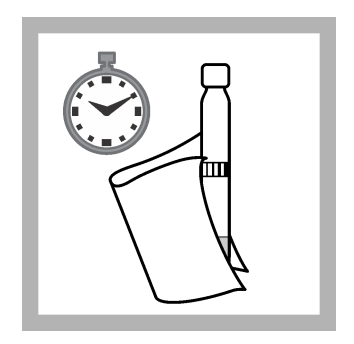
4. After 15 minutes , thoroughly clean the outside of the vial and evaluate.