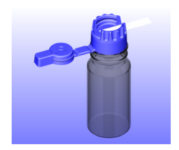
Test strip exposed to 500 mg/L arsenic