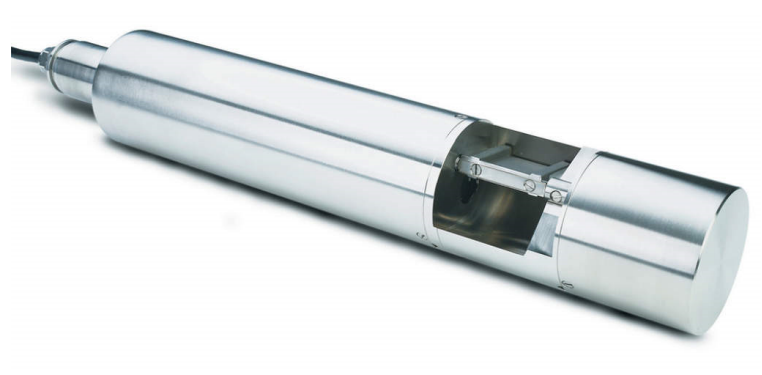
Figure 2: The Hach UVAS Sensor

The SUVA value is a measure of the dissolved organic carbon concentration available to likely form disinfection byproducts when chlorinated. The value can also be used in the process of removing natural organic matter to reduce the DBP formation potential.