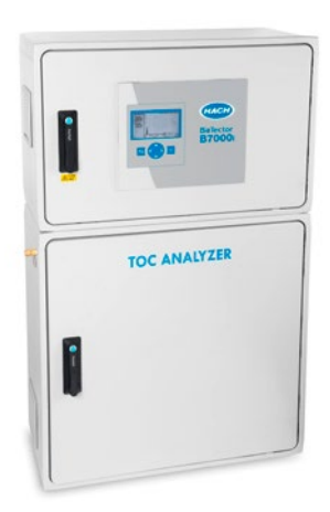
The Hach BioTector B7000i offers reliable online TOC monitoring in airports, allowing operators to monitor contamination in storm water runoff and surface water effluent, and to lower overall operating costs.

The Hach BioTector TOC analyzers provide reliable and accurate measurement, even in harsh environments and difficult applications. TOC analysis is important for airport applications, because the carbon concentration of the sample stream will determine whether the water is directed to surface water, sent to a wastewater treatment plant, or sent to the glycol recovery plant. The Hach BioTector B7000i analyser for airport applications incorporates three ranges to allow correct measurement of the carbon concentration at the corresponding measuring ranges. The analyzer can signal and switch between low and high analysis ranges automatically without any issues. The