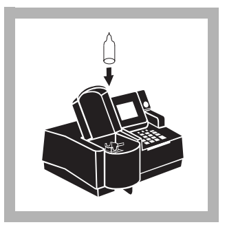
8. Immediately place the AccuVac Ampul into the vial adapter. Close the light shield. Result in μg/L dissolved oxygen (or chosen units) will be displayed.

Note: The ampuls will contain a small piece of wire to maintain reagent quality. The solution color will be yellow.