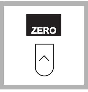
6. Press the soft key under ZERO .