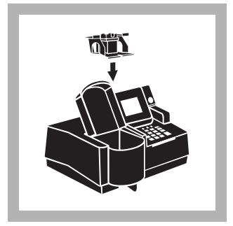
3. Insert the AccuVac Ampul Adapter into the sample cell module by sliding it under the thumb screw and into the alignment grooves. Fasten with the thumb screw.

The wavelength (\lambda) , 610 nm , is automatically selected.