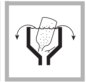
7. Fill a Low Range Dissolved Oxygen AccuVac Ampul with sample.

Note: For alternate concentration units press the soft key under OPTIONS. Then press the soft key under UNITS to scroll through the available options. Press ENTER to return to the read screen.