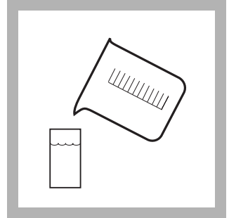
4. Fill a zeroing vial (the blank) with at least 10 mL of sample.